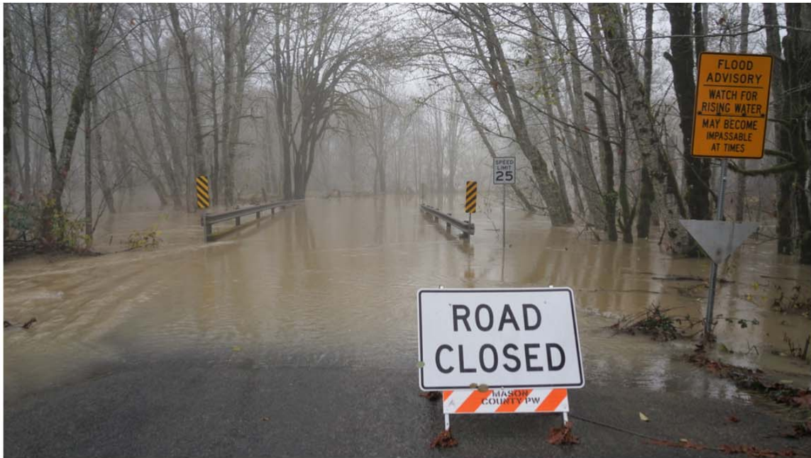
A Flooded Road

Dangerous weather can affect everyone. It can hurt people and destroy buildings! The most common kinds of dangerous weather are flooding, lightning, fog, wind and extremely hot or cold temperatures. You can talk to your parents and teachers about what to do at home and school during dangerous weather. This week's News-2-You® Extension Activity, located on the main web page, can help too. It has information about being prepared, and explains helpful phrases like “when thunder roars, go indoors” and “turn around, don’t drown.” These phrases remind you of ways to stay safe. Click on the Weather-Ready Nation website link below to learn much more!