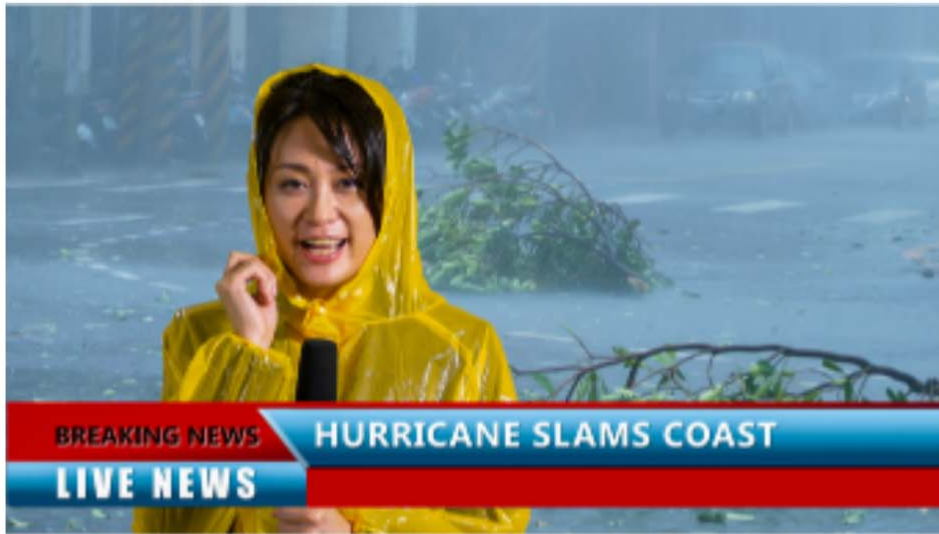
A Meteorologist Reporting Dangerous Weather

Do you sometimes have dangerous weather in your area? People across the U.S. may experience dangerous weather and need to be prepared. September is National Preparedness Month. A National Weather Service program called Weather-Ready Nation helps people prepare for dangerous weather. Weather-Ready Nation has a website that includes information, pictures and videos. People can use the website to learn about dangerous weather that could be nearby. They can learn how to prepare for this weather too. Being prepared can help people be safe!