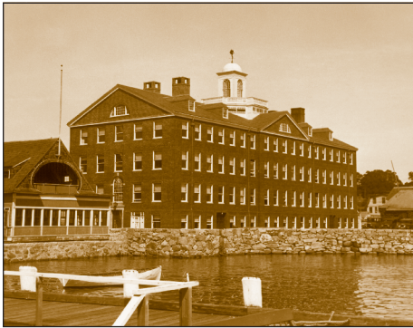
The Institution's first building, a four-story brick structure, was later named for Henry Bigelow.