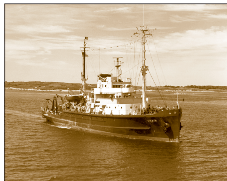
The arrival in 1958 of the research vessel Chain, a converted Navy salvage tug, signaled a move to big-ship oceanography.