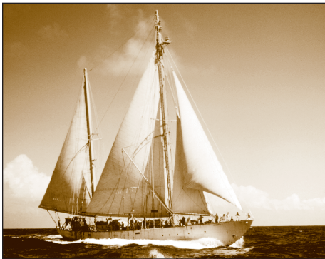
Bigelow applied knowledge gained on many research voyages in the Gulf of Maine to design of the first blue-water research vessel, the 142-foot steel-hulled ketch Atlantis .