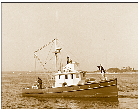
The 40-foot collecting vessel Asterias , named for a local starfish, completed the first fleet.

south of Cape Cod, a small but deep water harbor suitable for berthing oceanographic vessels, and proximity to several universities.