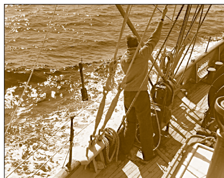
Data from bathythermograph, an important early instrument designed at WHOI, helped save US submarines during the war.