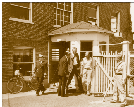
The Institution grew substantially during World War II as host to many Navy projects.