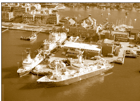
WHOI scientists range the world ocean from their laboratories based in the village of Woods Hole, pictured here in a rare moment with three ships in port, and on the nearby Quissett Campus.

grams Office administers a variety of additional academic activities.