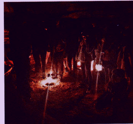
Learning about 3,000 year-old art in the cave