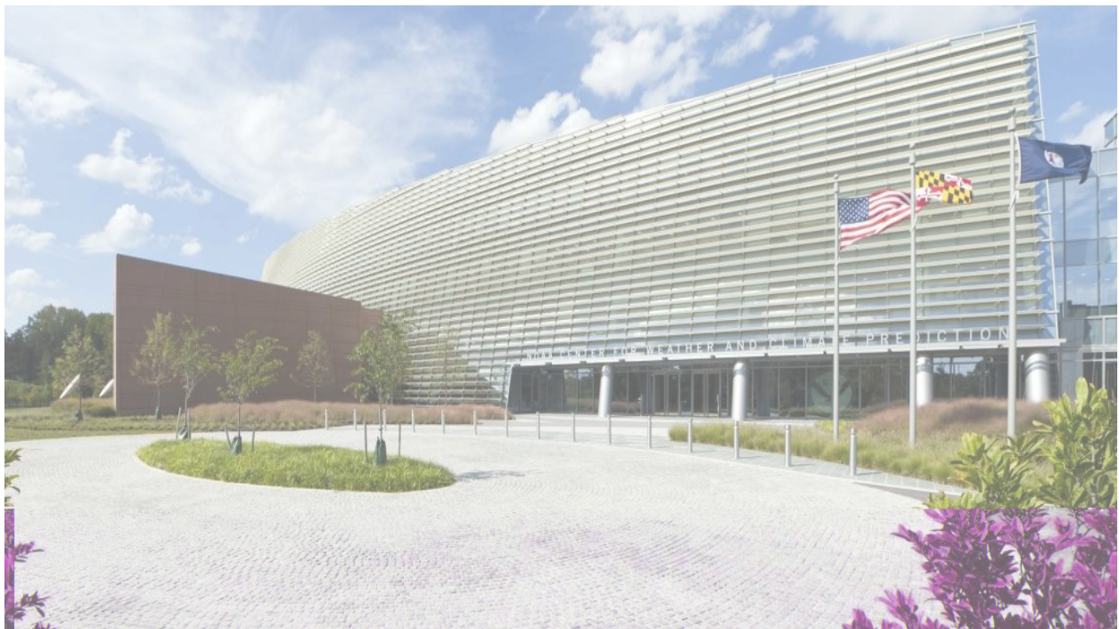
The Weather Prediction Center is located within the NOAA Center for Weather and Climate Prediction in College Park, Maryland