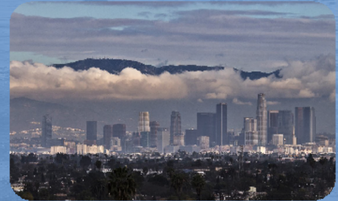
Some increased air pollution near the surface in the U.S. can be attributed to sources in Asia. (PNAS, 2014)

Air pollution moves up and away from ground level, and can cause harm far from the original pollution sources.