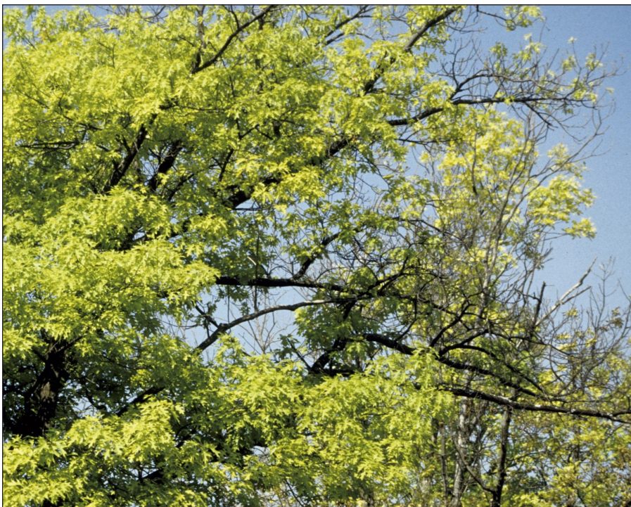
Figure 4. Dieback in oak tree

An approximated diagnosis can be made based on foliar symptoms, but soil should be tested to determine soil pH in order to confirm iron deficiency. Commercial growers may also consider a leaf analysis through a private laboratory. Contact your county Extension office regarding the correct sampling procedure and submission requirements for soil samples as well as information on leaf-testing labs.