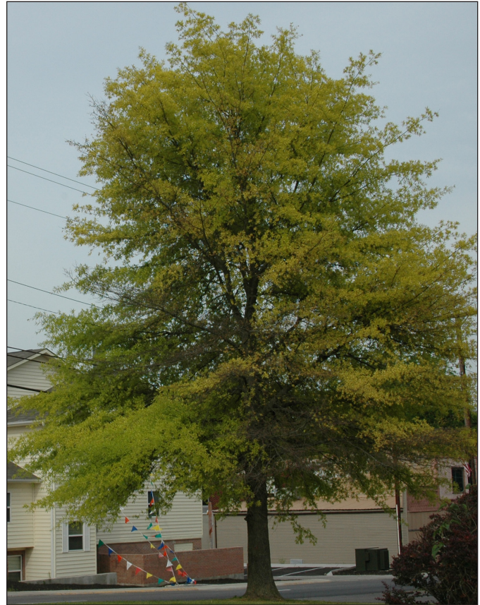
Figure 1. Willow oak with symptoms of iron deficiency (Win Dunwell, University of Kentucky)