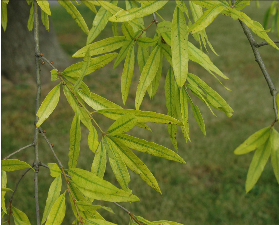
Figure 3. Necrotic (brown, dead) areas beginning to show up on iron deficient willow oak foliage (Win Dunwell, University of Kentucky)

Note: Soil pH is measured on a scale of 0 to 14. A pH of 7 is considered neutral. Readings below 7.0 are categorized as acidic, and those above 7.0 are classified as alkaline.