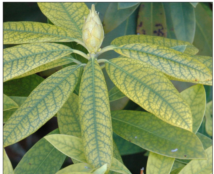
Figure 2. Yellowing between the veins of rhododendron leaves (Win Dunwell, University of Kentucky)