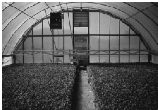
A greenhouse provides a protected environment for growing tobacco transplants, but careful management is required to achieve consistent results.

Note the difference in volume between the 338 and 338D trays; the 338D is a deeper tray. In general, as the cell volume decreases, so does the optimum finished plant size. The choice of tray comes down to maximizing the number of plants produced per unit area, while still producing healthy plants of sufficient size for easy handling. Smaller plants are not a problem for growers using carousel setters, but those with finger-type setters have difficulty setting smaller plants deep enough.