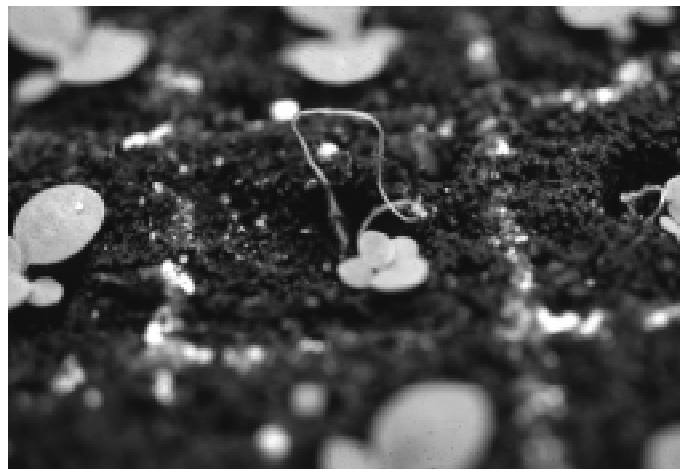
Figure 2. Large numbers of spiral roots indicate problems with tray filling.

To avoid over-packing, remember that many media are now pre-moistened and need little or no additional water to be prepared for tray filling. To test proper moisture content, squeeze a handful of media. When it is released, it should