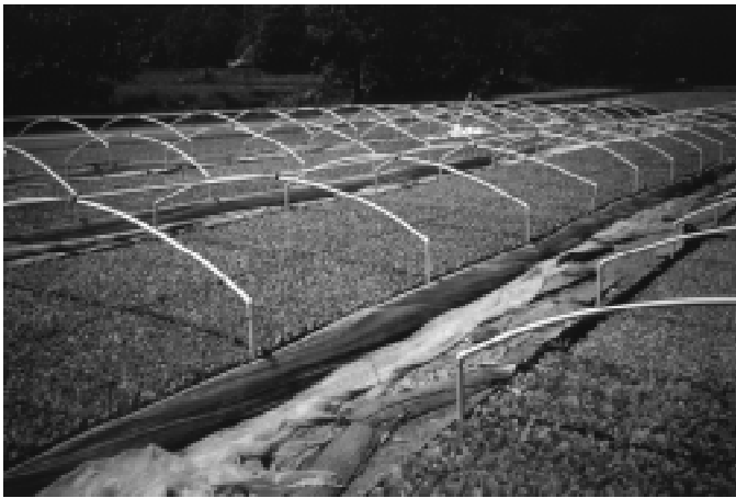
Outside float beds offer an economical alternative to greenhouses; however, there is a much greater risk of plant loss due to extreme weather conditions.