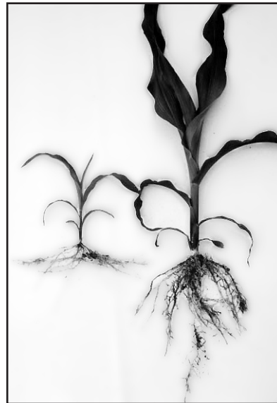
Figure 1. Corn plants collected from high (left) and low (right) traffic areas.

Tillage compaction is a result of the downward force exerted when tilling. Even implements (like a moldboard plow) that lift the soil can cause compaction at the leading edge of their blades. Tractor tires running in the bottom of the open furrow when making the next pass compound compaction problems. These actions can cause the development of a plow pan and reduce the effective rooting depth to the depth of tillage, usually only 5 to 8 inches. Plow pans are also common in tobacco fields as a result of using tractor-mounted roto-tillers to pulverize surface soil.