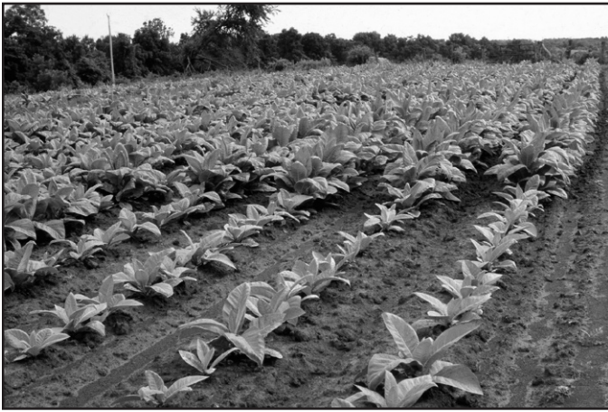
Figure 3. Tobacco research plots that were compacted by discing wet ground (foreground). Uncompacted plots are in the background. Notice the uneven size among adjacent plants growing in the compacted plots.

The soil will also show signs of compaction. Areas with standing water for prolonged periods indicate that soil compaction might exist. Layers with flat, thin, horizontal plates found when digging in the soil indicate compaction. Also, hard layers found when digging or probing the soil indicate compaction. This is especially true if reduced or deformed rooting patterns are also found and the layers remain hard when the soil is fairly moist.