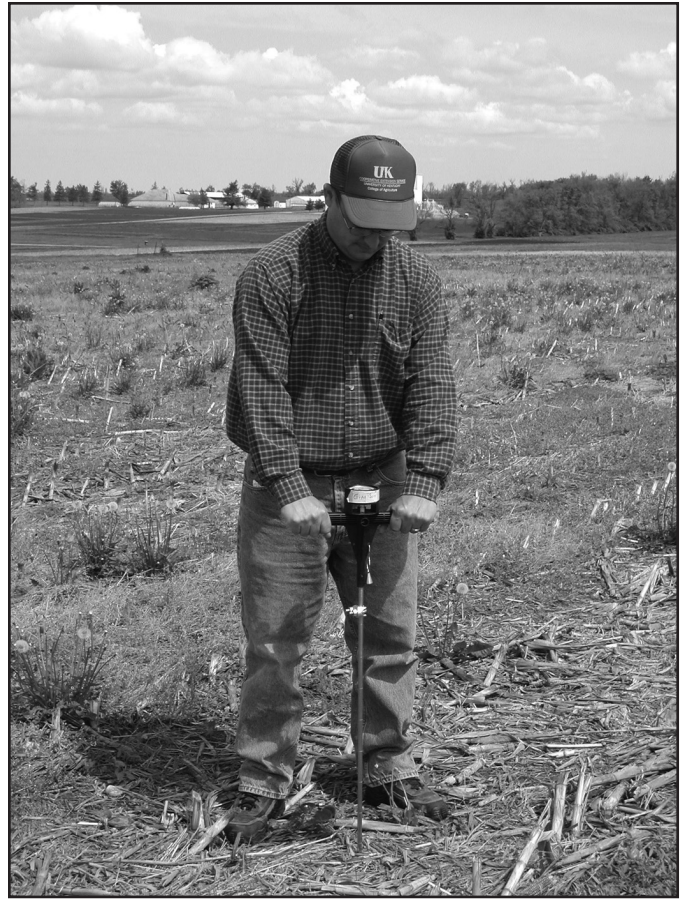
Figure 4. Measuring soil compaction using a penetrometer is similar to taking soil samples.

To use the penetrometer, slowly and steadily push it into the soil while watching the pressure gauge (Figure 4). The shaft of most penetrometers is calibrated in 3-inch increments so that you can determine the resistance with depth. As you push the penetrometer, record the highest resistance and the depth where the highest reading was obtained. Continue to push until the resistance drops, and note this depth as well. (A sample data sheet is included at the end of this publication.) If the pressure does not drop, then either the soil profile is not completely wet or you have hit a naturally dense soil layer that will not be remedied with subsoiling. These layers are most likely fragipan, heavy clay subsoils, or dry layers. Repeat the probing in random areas throughout the field. The more data you collect the more accurate the results will be. At a minimum, collect 10 to 20 readings in a small field or 30 to 40 in a large field. You may want to sample field entrances and high traffic areas separately.