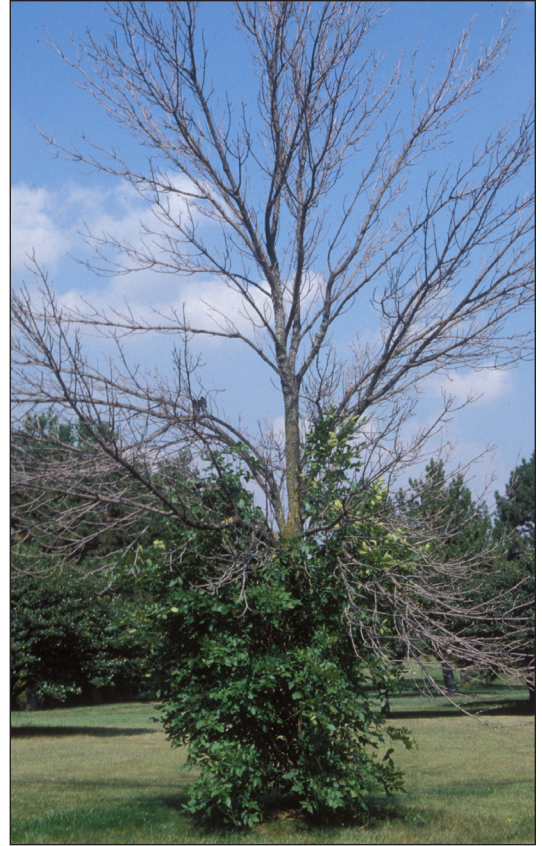
Figure 4. Severely declining or dying trees may re-sprout from roots, even though primary trunk is dead.