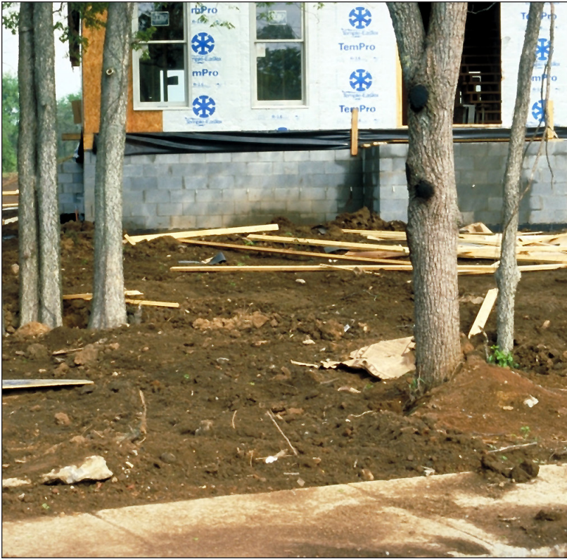
Figure 10. Grade changes from construction projects result in reduced soil-air exchange.