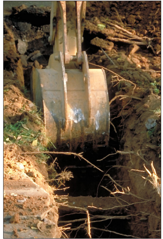
Figure 11. Damage to roots leads to reduced water uptake and exposes roots to invasive pathogens and insects.