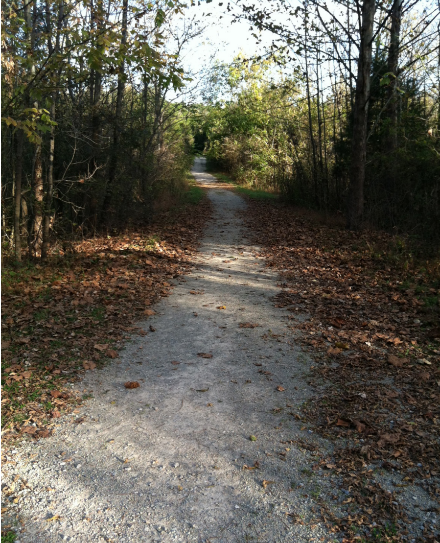
Figure 2. Trail in Pope Lick Park in the Parklands of Floyds Fork.

Trail projects are context sensitive and are specific to the community that visions and creates them. In both case study projects, non-profit organizations advocated for and shared responsibilities for supporting and maintaining the public spaces. Consideration of natural resources was necessary in order to prevent future environmental degradation and protect them from development pressure. The trail systems and greenway projects proactively proposed alternative solutions that addressed multiple goals ranging from environmental to recreational. Both projects worked to protect the quality of natural resources, encourage healthier behaviors, provide pleasant recreational opportunities, and encourage tourism while also having the potential to enhance property values. Although the Elizabethtown Greenbelt project shared some of the expansion costs and operations with a public entity, the Parklands of Floyds Fork is 100% donor-supported. Furthermore, guided flexibility in local land use and zoning policies can encourage creation of greenspaces that facilitate connectivity. However, these types of projects require intentional planning and design that will address the needs and visions of each community. Overall, these communities were able to effectively utilize their natural resources to enhance quality of life. While these case studies highlight trails, the concept and project specifics can apply to any Kentucky community large or small.