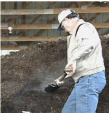
Sample manure as close to the time of land application as possible.