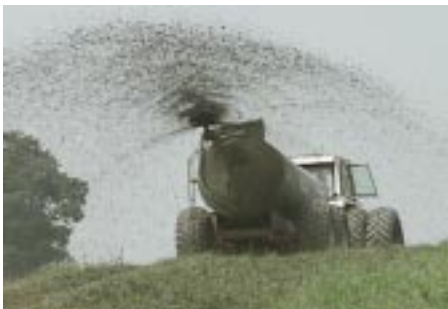
Liquid manure applications may be applied within 30 days of the beginning of crop growth unless heavy precipitation is forecast before the liquid could be absorbed into the soil profile.