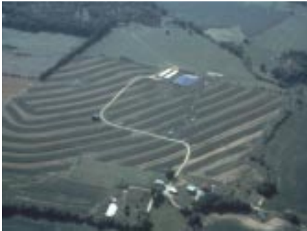
Contour strip cropping is one practice that reduces non-point source loss of nutrients due to runoff and erosion.

Including crops with a high phosphorus demand in a rotation can help draw down soil phosphorus levels following manure applications and reduce potential phosphorus losses in runoff water.