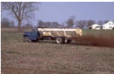
Apply animal manure when the crop can best use the nutrients it supplies.