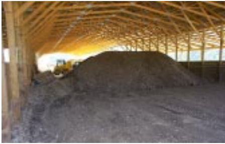
A covered structure provides manure storage until the appropriate application time.