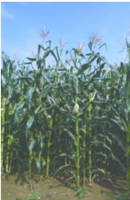
Spring is the best time to spread manure for a summer crop such as corn.

Manure should not be applied on frozen or snow-covered fields where subsequent rains could wash the manure off the field before it has a chance to move into the soil.