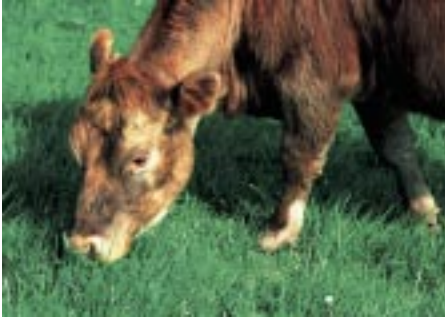
Nutrient cycling in pastures can be monitored by a good soil testing program (Photo courtesy of USDA NRCS).

When forages serve as the sole feed source in pasture systems, nutrients from the manure and urine of grazing livestock will not exceed the amount required by the forages. Livestock concentration in some areas of the pasture, except with rotational grazing, may result in uneven distribution of nutrients. Nutrients leave the pasture system only through animal growth or milk production. In general, only 25 to 30 percent of the nutrients taken in by grazing animals are removed from the field in this manner. The remaining 70 to 75 percent are returned to the pasture in the manure and urine. This recycling of nutrients should be monitored carefully by a good soil testing program. If nutrient management with pastures involves using a crop removal basis for determining the amount of phosphorus and potassium to apply, then only about 30 percent of the calculated amount should be applied. Otherwise, soil test levels may increase rapidly due to the excess of additions over that removed.