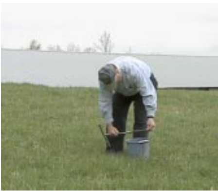
Soil testing is the foundation of a sound nutrient management program.