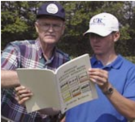
The Kentucky Agriculture Water Quality Act requires nutrient management plans on farms 10 acres or greater in size where nutrients are applied and/or utilized.

Grassed waterways are able to slow water and filter out contaminants. They are often combined with buffer strips or stabilization structures.