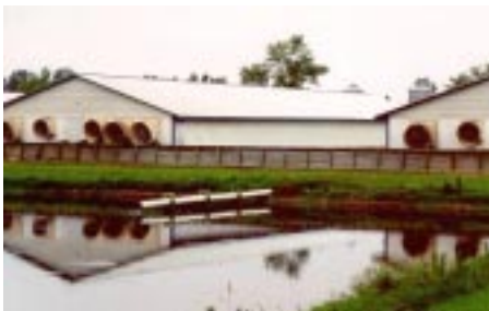
A lined earthen basin is an appropriate storage structure for liquid manure.