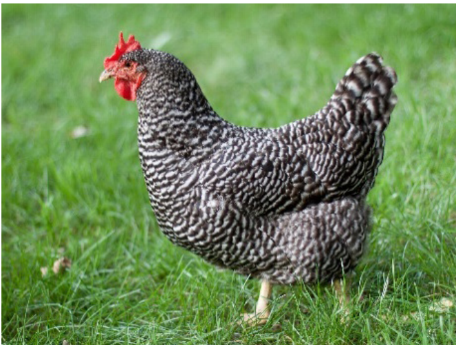
Figure 10. Barred Plymouth Rock.