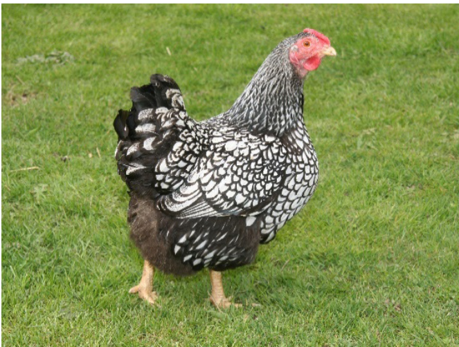
Figure 9. Silver-laced Wyandotte.