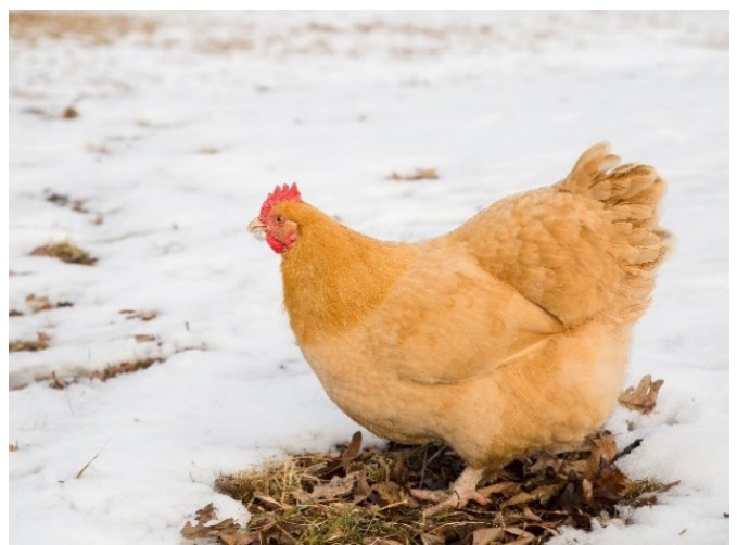
Figure 12. Buff Orpington.