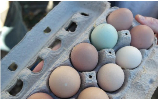
Figure 4. Eggs from a flock of different chicken breeds.

breeds. This was how the Ameraucana breed was produced (Figure 6) (when not up to the standards for the American Poultry Association, often referred to as an Easter-egger). Ameraucana hens lay a light blue, pink or green egg. Maran (Figure 7) hens lay a dark chocolate colored shell (Figure 8). Popular breeds for backyard flocks also include Silver-laced Wyandotte (Figure 9), Barred Plymouth Rock (Figure 10), Rhode Island Reds (Figure 11), and Buff Orpingtons (Figure 12).