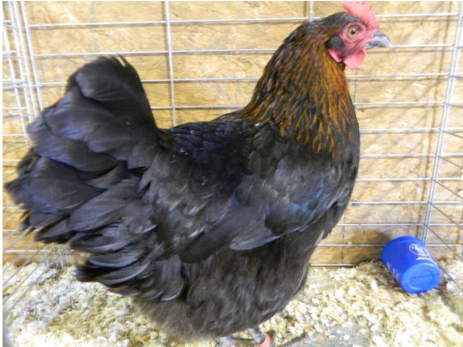
Figure 7. Maran hen.