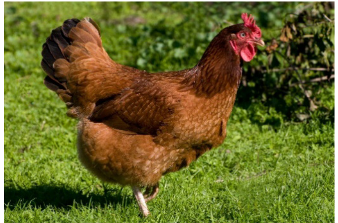
Figure 11. Rhode Island Red.