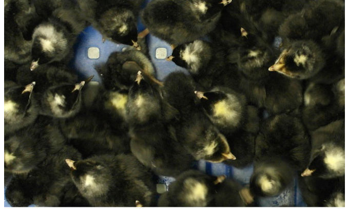
Figure 3. Chicks from a black sex-linked cross—female on the left, male on the right.