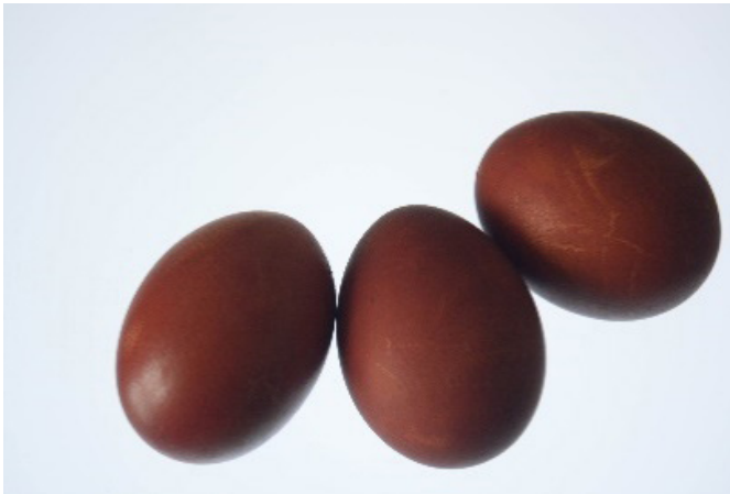
Figure 8. Dark brown eggs from the Maran breed