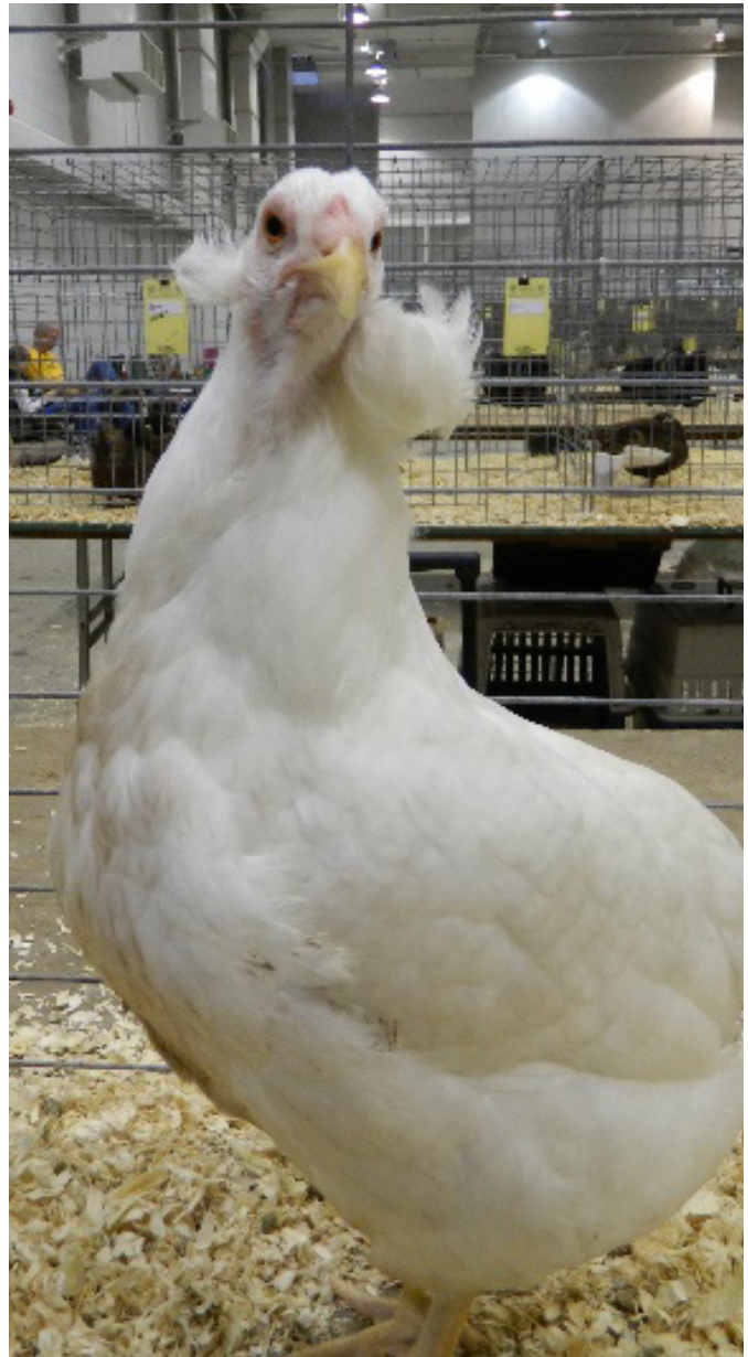
Figure 5. Araucana hen (rumpless and with tufts of feathers projecting from the face).

For whichever breed you select, it is important to source your flock from a hatchery participating in the National Poultry Improvement Plan (NPIP). If bringing the chickens in from out of state, it is required that the chickens come from an NPIP hatchery that is certified avian influenza clean.