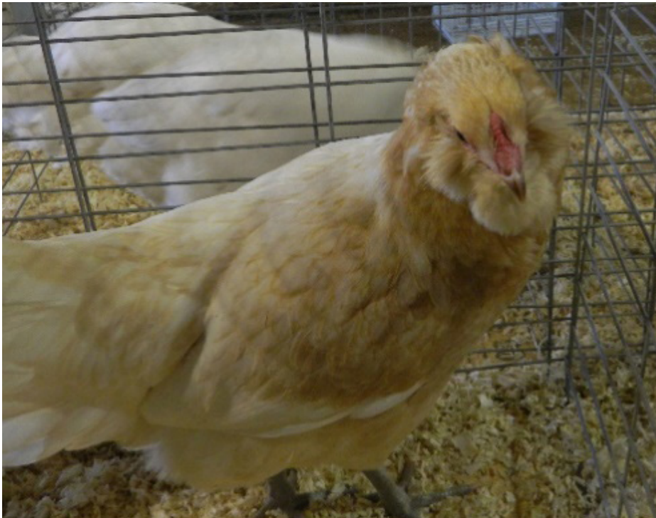
Figure 6. Ameraucana hen (with a tail and muffs and a beard rather than feather tufts).