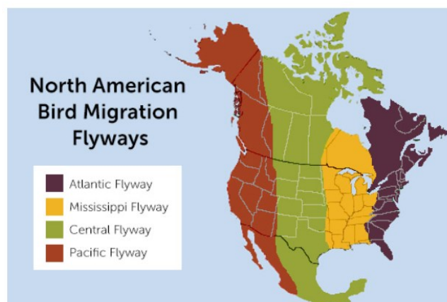
Migratory flyways. Map by ABC.

The H5N1 strain currently circulating in North America is an environmental health concern since it is very persistent. It is not following typical seasonal trends. It has adapted to infection in mammals, including domestic pets. There is a risk that the virus could become endemic in the Americas which presents challenges for managing continuing risks to poultry and wildlife in Canada.