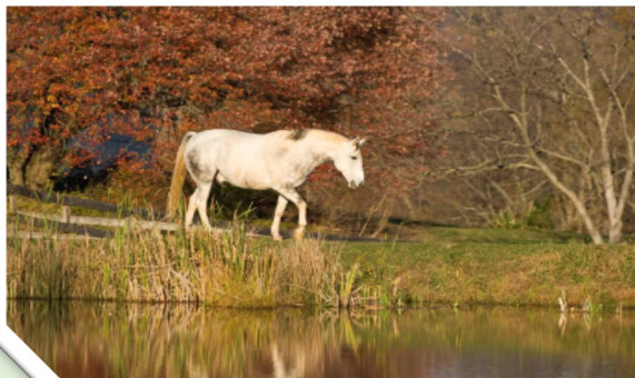
with a higher risk of developing laminitis should out in the very early morning hours.

Laminitis in horses can strike any time of year, for a variety of reasons, but veterinarians and horse owners see endocrinopathic cases most commonly in spring and autumn. Understanding your horse's risk level for this painful and potentially deadly hoof condition—and the physiological differences between spring and autumn