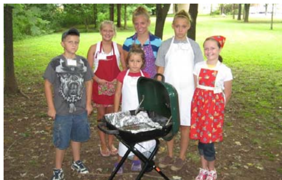
There were six participants in the event—five juniors and one senior.