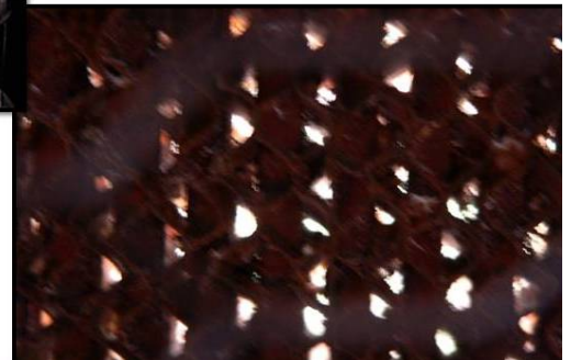
Old 2" Pad

holding the pad together to maintain its integrity and also helps reduce the buildup of algae. To reduce the growth of algae, an algicide can be used in the water for the cooling pads.