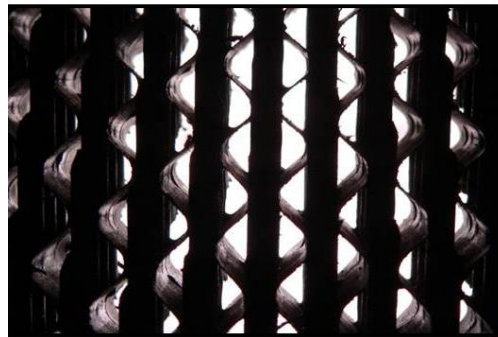
New 2" Pad