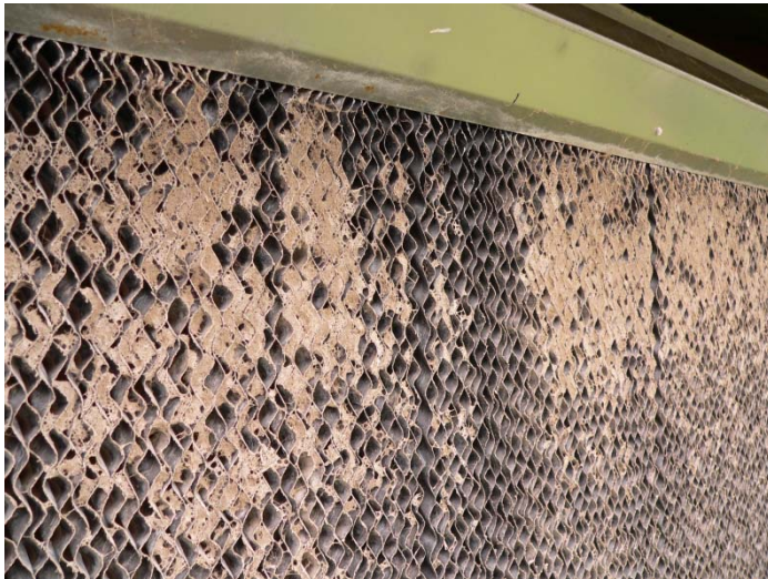
Clogged pads restrict airflow and reduce cooling capacity

Example Products: Clorox, Purex, Peraclean 5, Proxy-Clean, Muriatic Acid