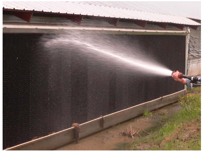
A gentle spray from a garden hose is best for rinsing pads. Cellulose pads are easily damaged with a high pressure washer.