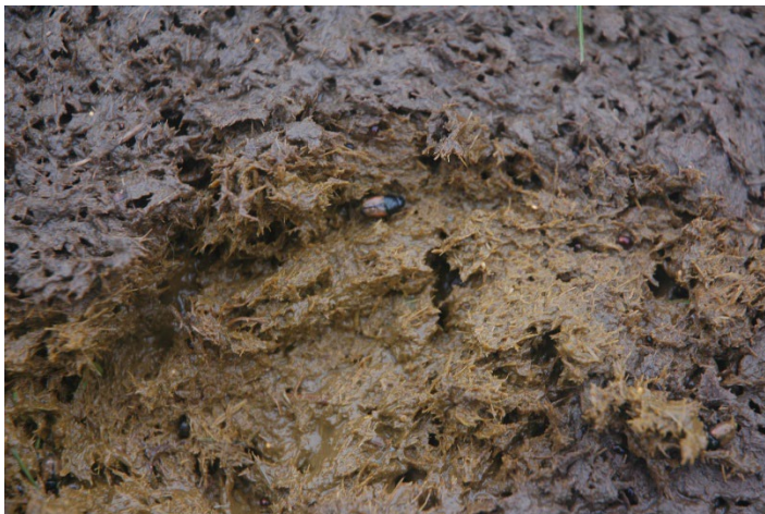
Figure 3. Nitrogen fixed by legumes is shared indirectly with grasses through grazing and subsequent deposition of dung and urine. In this photo dung beetle is hard at work breaking down a cow patty.

Always inoculate or use pre-inoculated seed. Since legumes fix nitrogen from the air by forming a symbiotic relationship with Rhizobium bacteria, inoculating seed with the proper strain of nitrogen fixing bacteria prior to planting is the best way to ensure optimal fixation.