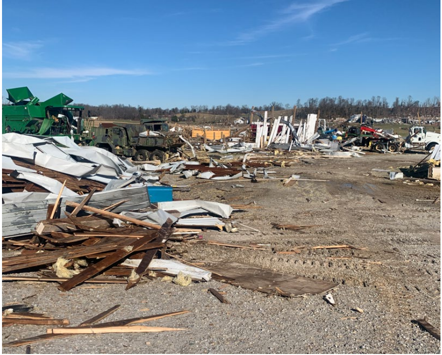
Damage to farm equipment, storage sheds, and one of the cattle handling facilities at the UKREC.

When securing animals on a storm-damaged operation, evaluating feed and water resources is also essential. It is possible that even if your operation only sustained minor damages, that impacts to surrounding areas could impact municipalities. It may be necessary to haul water to cattle. The storm may have affected feed resources, including hay, grain, and feeding equipment. People in the agricultural community are quick to jump in and help, so taking a few moments to determine your needs will allow others to assist you more efficiently. At the UKREC, we lost water and needed to have water trucked in for several days.