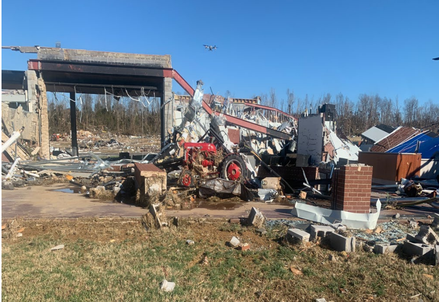
This Farmall Cub tractor was one of the original tractors used at the UKREC. It had previously been restored by the farm staff and was on display in the lobby of the UKREC and Grain and Forage Center of Excellence.

Cattle may also abort due to the stress of weather events. Pregnancy is a luxury; it is not necessary for survival. When cows experience stress, such as extreme weather events, biological processes kick in to help them survive (think fight or flight response). These processes affect every part of the body with the end goal of helping the cow survive. Thus, luxury processes such as pregnancy or even lactation can be negatively affected by stress. Keep a close eye on nursing calves in the days and weeks following storms, especially those whose dam may have been injured or killed due to the storms.