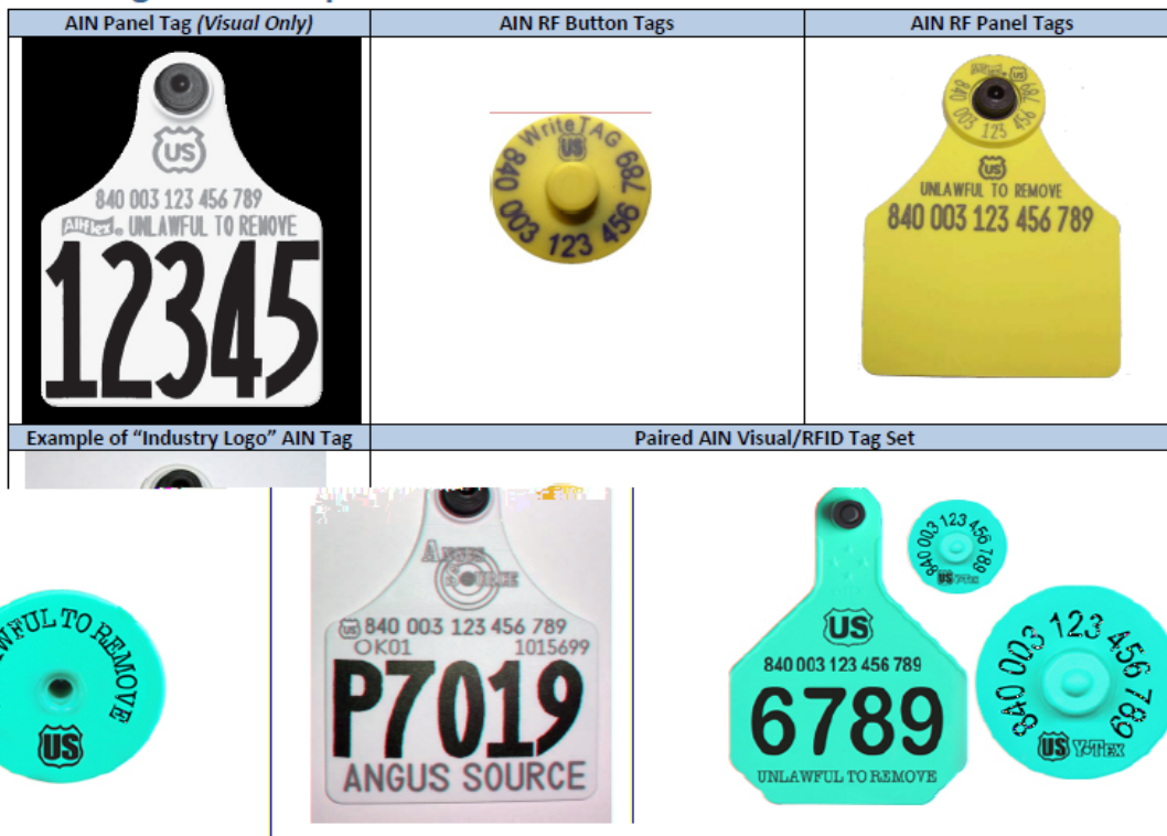
Figure 1-Examples of USDA official identification for cattle. All USDA Official animal identification number (AIN) tags, as pictured, are imprinted with a 15-digit number starting with 840 (840 is the official US country code), all have an official US ear tag shield, the words “unlawful to remove” and the manufacturer’s logo or trademark. Tags can be visual only (top left example) or may have RFID technology which allows them to be read visually or electronically. RFID tags must have all 15 digits printed on the button tag piece containing the transponder. Producers can purchase 840 tags from an authorized tag manufacturer or an accredited veterinarian who is qualified as a “Tag Manager”.

A useful system for evaluating health data will contain much of the same information used for analyzing performance. First and foremost, every cow and every calf must have individual identification (ID) that is readable, permanent and without duplication. Each calf ID must be matched with his or her dam ID. Ear tags are commonly used and ear tags with radio frequency identification (RFID) technology (see Figure 1) are growing in popularity because information such as weight can be automatically sent to the computer along with the electronic tag number with the use of a “reader”. Other useful information to record includes breed, sire, age of dam, calf’s birth date and sex, birth and weaning weights, weaning date, weight and/or body condition score of cows at weaning, and “contemporary group code” such as