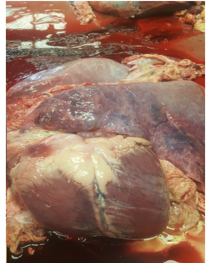
Heart and lungs from a cow with heart failure due to ionophore toxicosis. The lungs have a wet appearance compatible with pulmonary edema.

Definitive diagnosis of ionophore toxicosis is not a simple task. Diagnosis is based on a history of exposure to an excessive dosage of ionophore and either sudden death or evidence of heart damage and failure on necropsy.