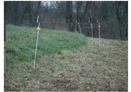
Figure 1. Strip grazing stockpiled grass can extend grazing by as much as 40%.