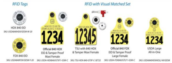
Figure 2: Commerce Compliant ADT (Allflex). Accessed 6/6/2024 at https://www.allflex.global/na/wp-content/uploads/sites/7/2022/04/Commerce-Compliant-ADT_ADP003_R6.pdf

The minimum identification standard in cattle is the visual 840 tag. For visual-only tags, the entire official identification number must be imprinted on the portion of the tag inside the animal’s ear. This will suffice if the cattle never leave the state of origin within their lifetime , however, interstate travel requires a tag with electronic capabilities. For electronic ID tags, the entire 15-digit official identification number beginning with 840 must be imprinted on the portion of the tag containing the transponder (see Figure 2). Be aware that manufacturers still sell tags beginning with 900 numbers used for in-herd data use only and cannot be used as Official ID.