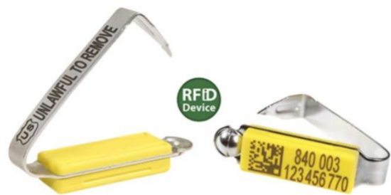
Figure 4: For those producers nostalgic for metal tags, Shearwell Data Ltd is the first company in the world to offer an official metal EID tag for cattle, that combines the durability of a metal tag with the reliability and RFID capabilities of an EID tag. https://shearwell.com/met-tag-metal-cattle-rfid-tag-official