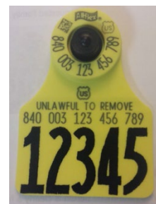
Figure 3: Example of an Official Tag