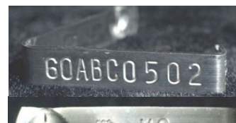
Figure 2: National Uniform Eartagging System (NUES) Metal Tag (“Silver” or “Brite” Tag).

No, all visual-only official ID tags applied prior to the date the rule is effective will be considered official identification for the animal’s lifetime including the metal NUES tags (Figure 2), commonly referred to as “silver” or “brite” tags, and the Brucellosis Vaccination metal tag, an orange metal tag that indicates the animal was calfhood vaccinated for Brucellosis (Bangs Disease). However, a visually and electronically readable official eartag may be applied to animals currently identified