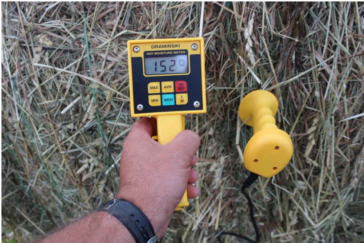
Figure 2. This hay was baled above the 18-20% moisture range and has reached an internal temperature of more than 150 degrees Fahrenheit. Heating damages protein making it unavailable to the animal. If stored in a tightly packed hay barn, this bale could start a hay fire.