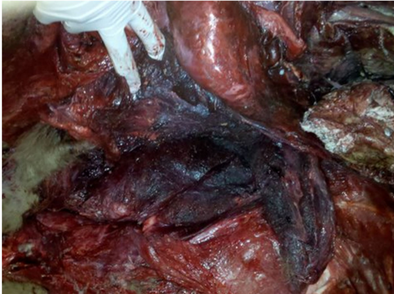
Figure 1: Photo of hindlimb muscle affected with blackleg. Note the red to black discoloration.

in dark red to black discoloration of the affected muscle (see Figure 1). When cut, the affected muscle has a characteristic odor of rancid butter. Diagnosis is easily made at necropsy and the bacteria type can be confirmed with several different tests.