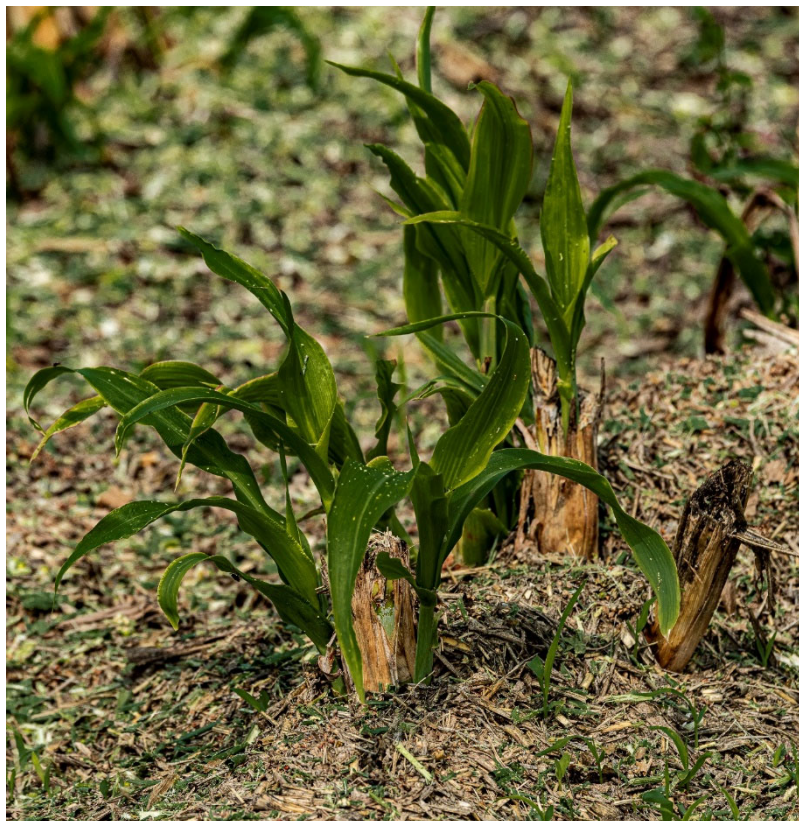
Will this plant kill cattle? This tender regrowth of forage sorghum can be very toxic to cattle if grazed in quantity. Often confused with nitrate toxicity, cyanide toxicity is a potential problem with all sorghum species, including johnsongrass.

So, what do you think? Easy? Hard? My students had a bit of a problem with it the first time (just might have been the instructor, I am afraid). Here are the answers and some explanations.