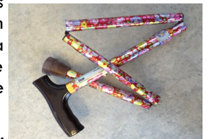
Figure 3. Folding Cane

Aluminum canes typically have an adjustable length, so perfect fitting before purchase is not always critical. Aluminum canes are also available as a “folding” cane that can be collapsed for compact storage when traveling (Figure 3).