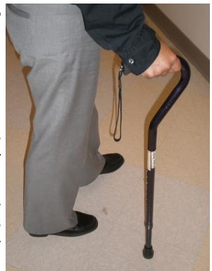
Figure 4. Offset Cane

Offset canes (Figure 4) are similar to standard canes except the shape positions the patient’s weight over the axis of the cane. This allows the cane to be used for occasional weight bearing. Offset canes are often recommended for patients who have arthritis in the hip or knee and occasionally need to decrease the weight borne on a painful lower extremity.