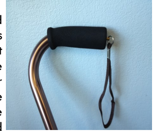
Figure 7. Padded Horizontal Palm Grip

A variety of handle styles and grips are available, and patients with certain hand and wrist problems may find some more comfortable than others. For example, carpal tunnel syndrome has been reported with the umbrella-style handle often used on standard canes, while foam-padded horizontal palm grips (Figure 7) are less likely to cause this problem. Patients who need wrist support or who have a need to decrease stress on the wrist may benefit from an ergonomic handle (Figure 8). These handles are also available for right-hand or left-hand use.