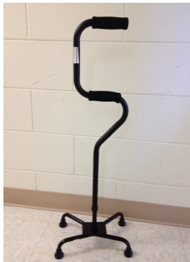
Figure 6. Sit-To-Stand Cane

The solution to this challenge in some cases is to change from a wide based quad cane to a narrow based quad cane or even a tri cane. The faster an individual walks, the fewer legs are needed and the closer together the legs can be, though the trade-off is some loss of stability during weight bearing phase.