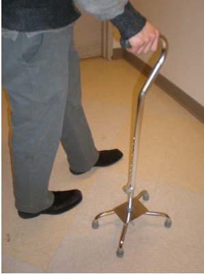
Figure 5. Multiple-Legged Cane

In addition to weight bearing, another advantage of a quad cane is that it stands upright by itself when not in use. This frees patients' hands to do other things until they need to resume walking, and the cane can be retrieved without needing to bend down. There is also a modified quad cane known as a "sit-to-stand cane" which combines the stability of a multi-legged base with a bent handle that can be gripped at two levels (Figure 6). This allows patients to put weight on the cane