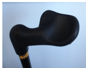
Figure 8. Ergonomic Handle

When walking with a cane, it is generally held by the arm on the same side as the patient's stronger leg. Advance the cane simultaneously with the opposite (affected) leg. If the patient's gait is affected bilaterally, then the cane is usually held in the dominant or unaffected upper extremity.