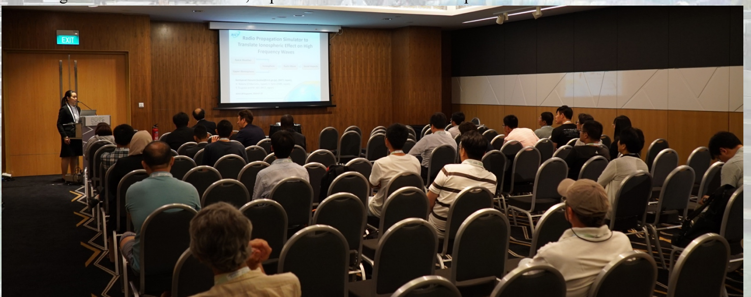
Figure 4: The AOSWA session, “Space Weather Research and Operation in Asia Oceania”

After the AOSWA session, the Exhibition Booth was opened on the evening of July 29 th . Thanks to the Exhibition hall was located at the center of the conference complex, and also used as the venue of Poster session, conference reception on the 1 st evening, every coffee break and the beer hour, our booth was blessed with a lot of participants about 10 to 20 people per hour.