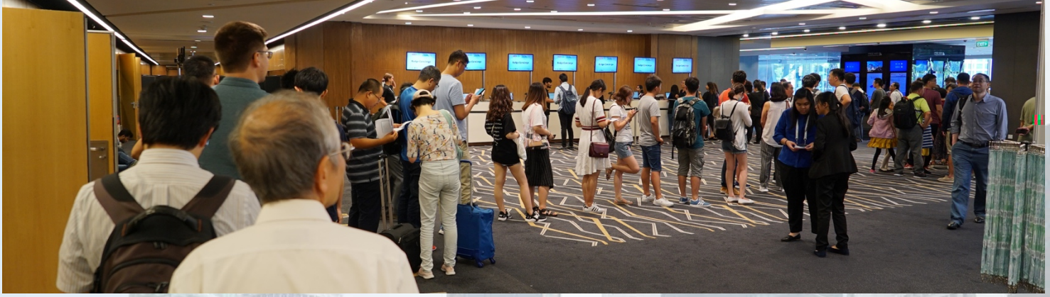
Figure 3: Many participants at the AOGS check in site

“The Relationship Between Equatorial Plasma Bubble and Evening Counter Electrojet Current Measured in West of Southeast Asia” by Nurul Shazana ABDUL HAMID from Universiti Kebangsaan Malaysia,