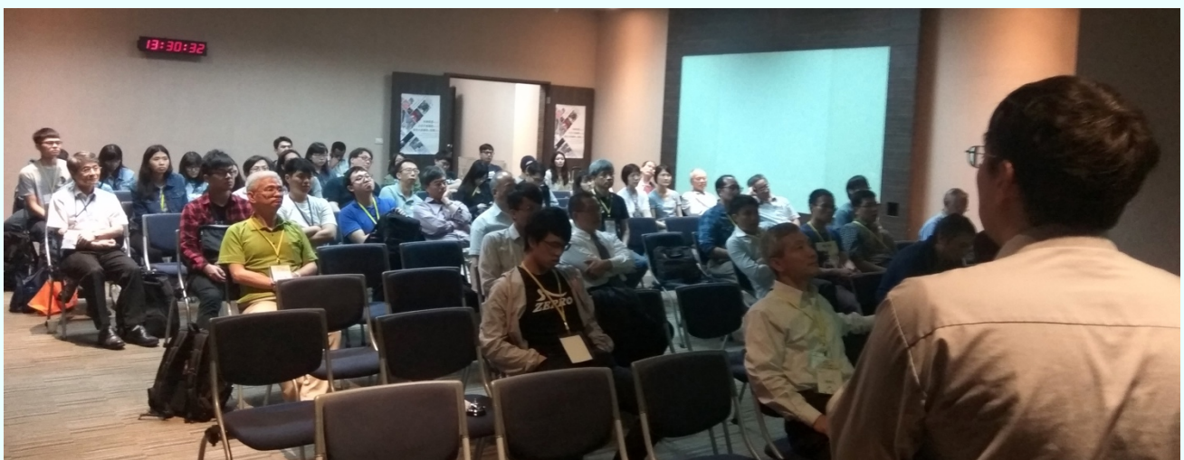
Figure 5: Audiences of Sounding Rocket Application Forum

In summary, Taiwan’s location just right under the equatorial ionization anomaly region as the highest ionospheric electron density, which could influence radio communications and global positioning systems. A large number of great research results and satellite missions are success to investigate the ionospheric morphology and influence. It was a best opportunity to benefit space weather operation and make close partnership of space science community in Taiwan by this fulfil meetings of TGA.