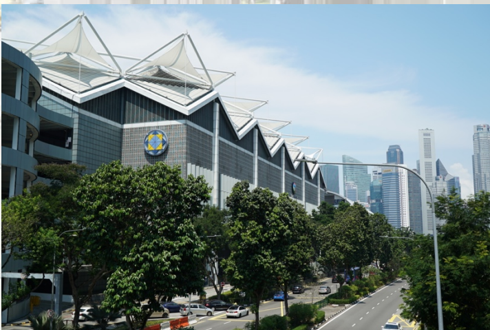
Figure 1 & 2: The venue, Suntec Singapore Convention and Exhibition Centre, Singapore

“Radio Propagation Simulator to Translate Ionospheric Effect on High Frequency Waves” by Kornyanat HOZUMI from NICT, Japan,