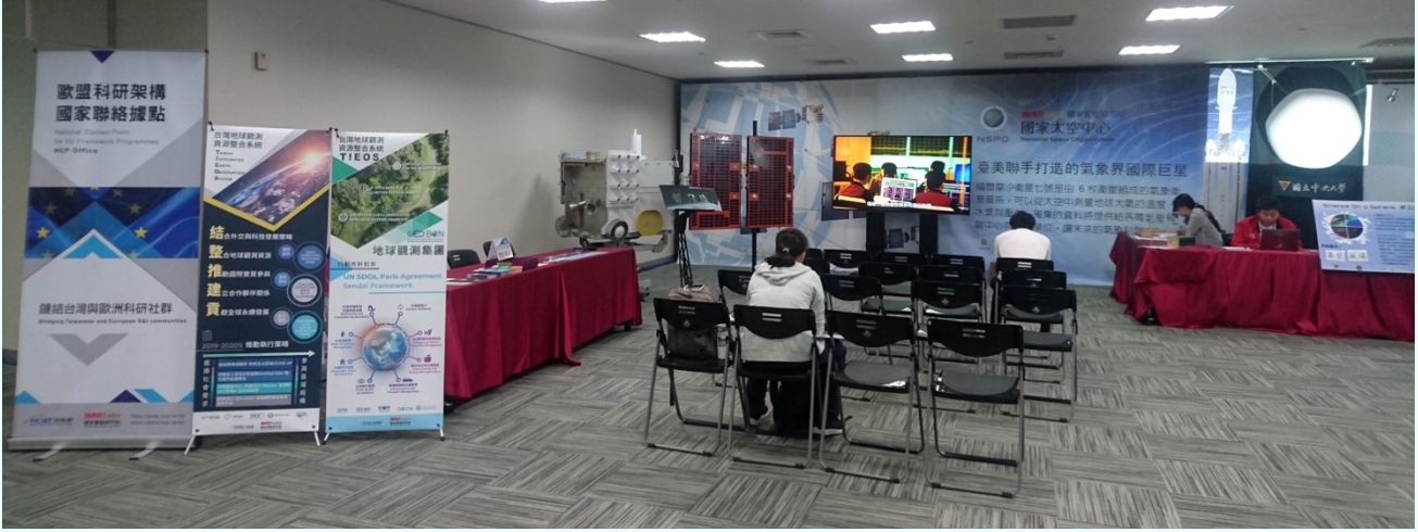
Figure 4: The National Space Organization (NSPO) of the National Applied Research Laboratory demonstrated FORMOSAT-7 model and provided lectures at the Popular Science Area of 2019 TGA.

Meanwhile, I also gave a presentation entitled “Space Weather Models for Operation in Taiwan” mainly about the models which are operated at the Space Weather Operational office, Central Weather Bureau to provide forecast and service for magnetopause, ionospheric scintillation and electron density. Before the end of my talk, a new developing research-to-operation (R2O) transition procedure by virtual machine technic was also introduced. We are seeking more collaboration between operational office and scientific group. However, it is difficult to transfer well developed software and/or system from research teams due to environmental conflicts. Thus, we proposed this procedure to shorter the time for transition