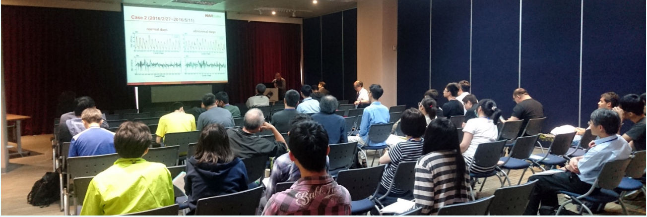
Figure 2: Audiences of the International Conference on Space weather

Three topics related to AOSWA associates are the “Satellite Missions for Space Science”, “International Conference on Space weather”, and “Sounding Rocket Application Forum”. They were hosted to report results and activities of space weather research and operation.