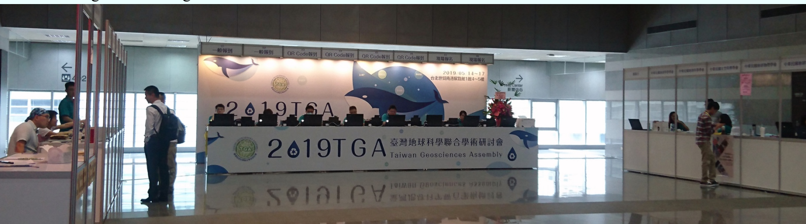
Figure 1: The registration site of 2019 TGA