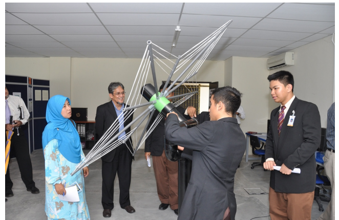
Figure 5: Presentation given by participants of the 2013 Space Weather Innovation Competition

ANGKASA was born out of a vision to be a leader in space science and technology research in Malaysia. We believe with the strong support from everyone, ANGKASA will be able to continuously contribute to the development of science and technology, not only academically through its successful graduates, but also through its scientific research and remarkable research publications. These efforts are in line with the university's mission that practices the 5P culture to be the "Guardian of the Nation" in keeping with its role as the National University.