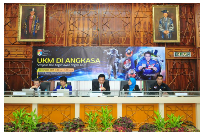
Figure 2: Research discussion on future space research with Chiaki Mukai and representative from JAXA.