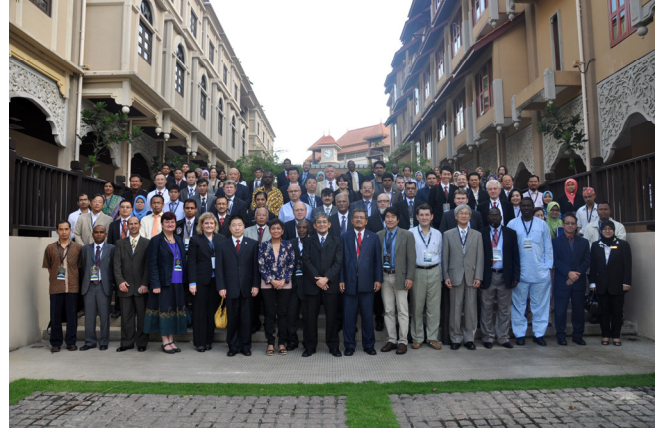
Figure 4: 2011 United Nation Human Space Technology Expert Meeting

pected to stimulate the interests of more young talents in the field of science and technology, particularly in the rapidly advancing scientific fields such as space science, where these programs are not only organised for the university community but also suitable for the younger generation from outside the university.