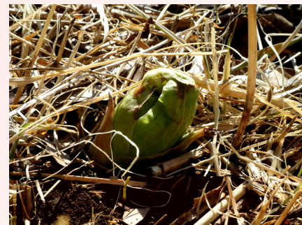
Butterbur Sprout from the ground in Usui :Feb 19