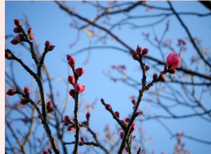
Buds of Japanese apricot in Risshun :Feb 4

AOSWA-3 is coming soon and this would be the one of the best time to visit to Japan, especially Fukuoka. Because the destination of Excursion “Dazaifu Tenmangu” is the one of most popular sight seeing place well known for “plum blossoms ” and now is the best season. I would like the attendee to enjoy the various sign of spring in Japan. I look forward to seeing you in Fukuoka!