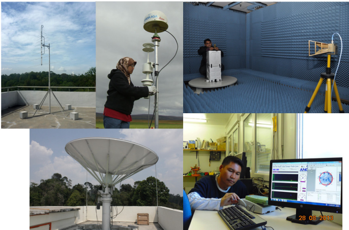
Figure 3: Research Facilities of ANGKASA

ANGKASA is committed in providing facilities and research equipment that are conducive and supportive of teaching and learning activities. Thus, all staff, academicians, and students are provided with workplace, laboratories, general function room, meeting room and discussion areas which are located at the Research Complex in UKM, Bangi. These facilities come complete with research equipment such as Radio Telescope, Ground Station, Network Analyzer, GNSS Ionospheric Scintillation and TEC Monitor (GISTM), Very Low Frequency (VLF) Receiver, Anechoic Chamber, Equinox Telescope and many others. Additionally, ANGKASA has also installed research equipment outside the main campus such as the Trimble NetR8 with Zephyr Geodetic 2 Antenna in Universiti Malaysia Sabah, and the Magnetic Data Acquisition System (MAGDAS), and GNSS Ionospheric Scintillation and TEC Monitor (GISTM) both installed in Langkawi. Meanwhile, we have also installed the Trimble GPS Receiver in Scott Base, Antarctica, and the GPS Leica System in Husafell.