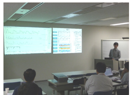
Space Weather Event Report meeting

Space Weather Event Report meeting (STE Events Report and Analysis Workshop) is promoting collaborative analysis of observation and simulation data to study latest space weather events for understanding solar-terrestrial connection. This activity has continued for several decades in Japan. Two event report meetings are held in a year in NICT, Tokyo and Kyushu University, Fukuoka. The most recent events that occur in the first half of the year and the latter half of the year are reviewed in each meeting. Latest three or four scientifically interesting events are selected and are studied in the meeting. One workshop is held for analysis of a specific topic such as extreme space weather events.