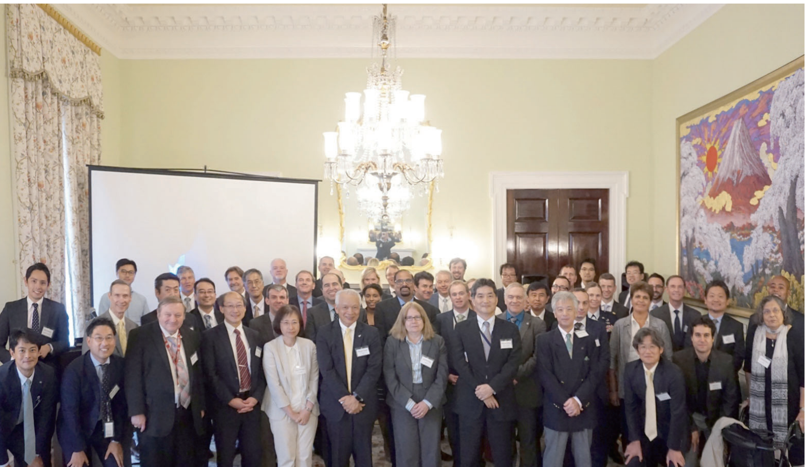
Figure 3 Group photo of the event