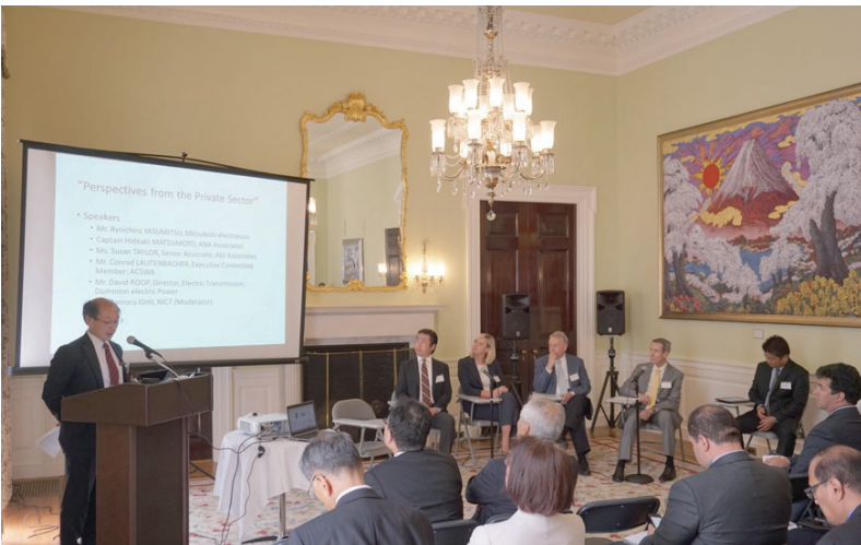
Figure 2 Session 5 “Perspectives from the Private Sector”

reviewed the efforts related to the Space Weather by Japanese and American private companies. Especially, the contributions by