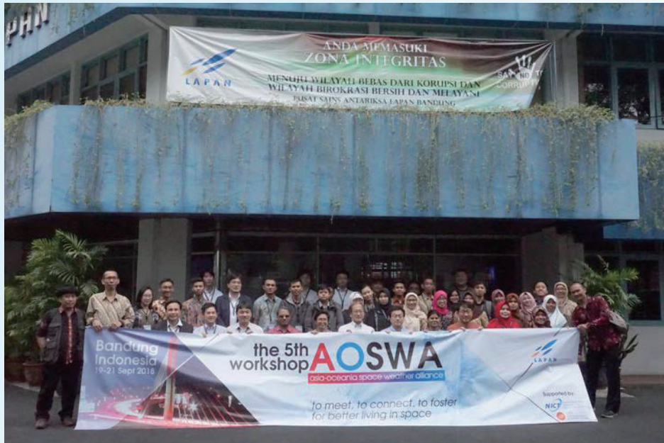
The another group photo in the excursion

I felt a lot of things from AOSWA5 LOC, all the LAPAN staffs. They made a significant contribution through the workshop; picked us up at the airport voluntary by smooth drive, worked harder from morning to the business meeting in mid night, and invited us to the wonderful excursion to LAPAN headquarter and Indonesian traditional musical. I would like to express my grateful to the LOC. And also I hope to contribute to AOSWA like them.