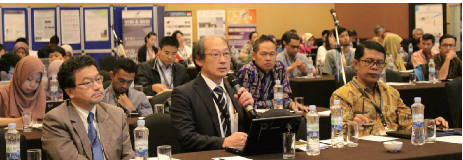
Figure 3 Warm discussion during the session

Besides scientific presentations and updates from distinguished researchers, there were also live space weather forecasts by a number of AOSWA institution members, at most twice a day. Various methods and models to predict Solar and space weather activities were presented on stage.