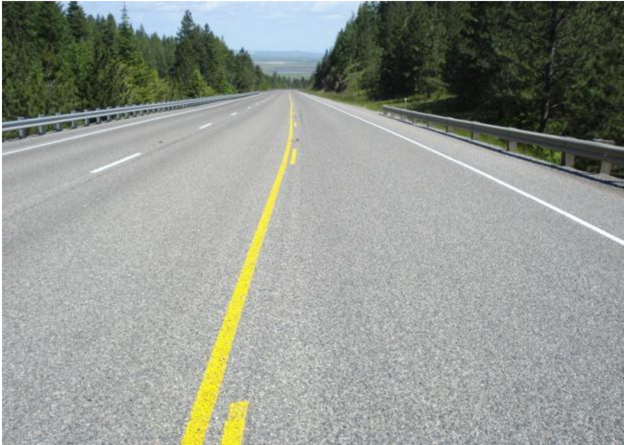
US-95, Milepost 232, Whitebird Hill, Looking North A Desirable Chip Seal