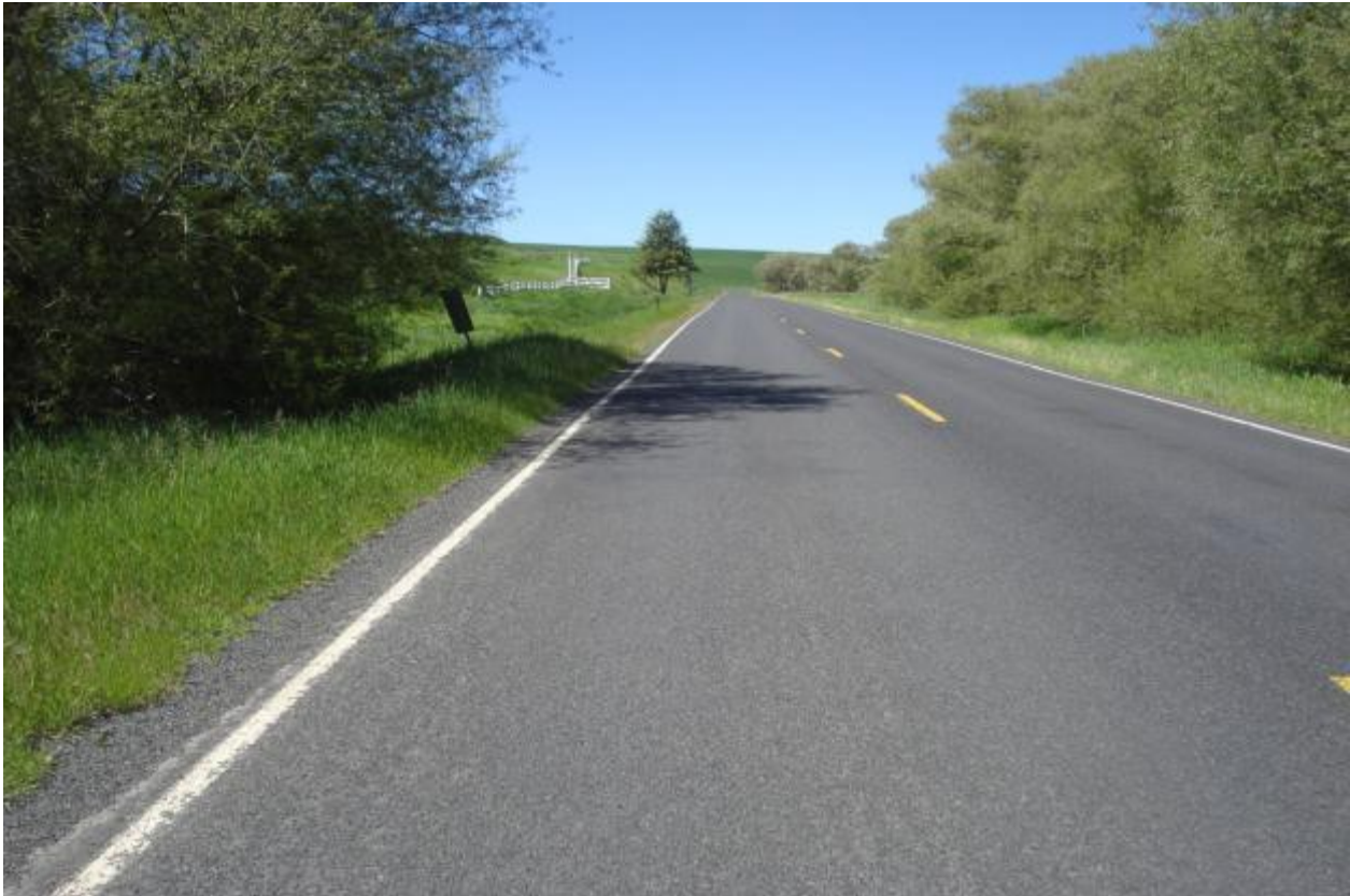
Desired appearance at the end of the warranty period