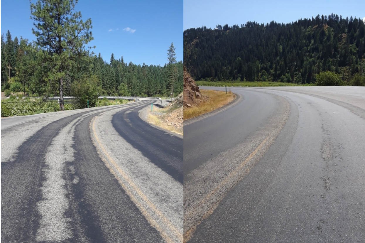
Catastrophic Chip Seal Loss