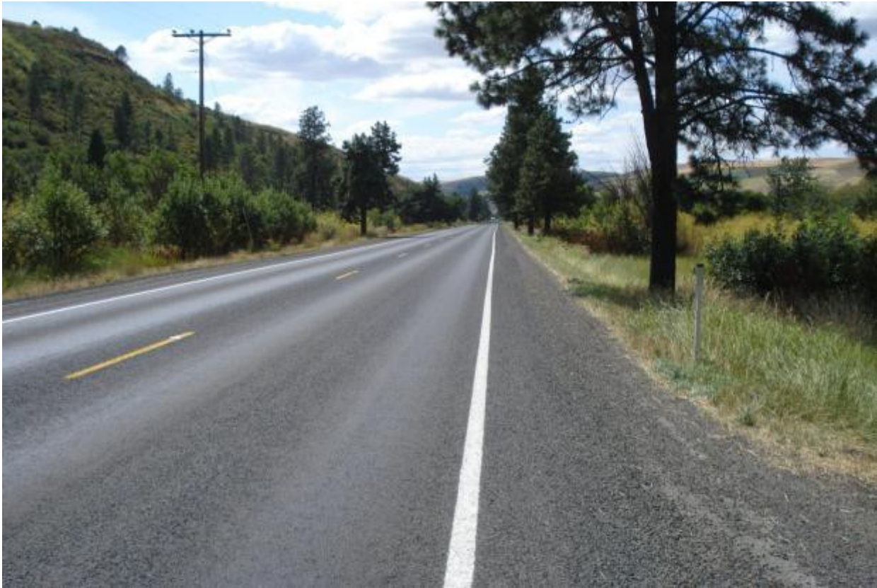
Tracking: Acceptable appearance at the end of the warranty period