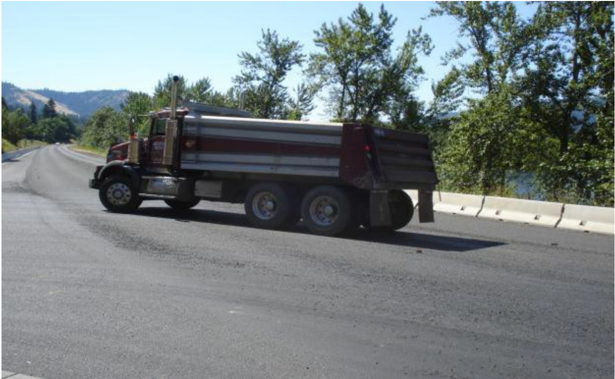
Traffic: Chip loss from turning movements (CODs)