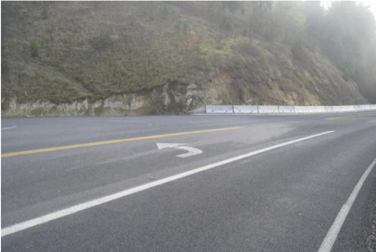
Traffic: Skid marks (NCODs)