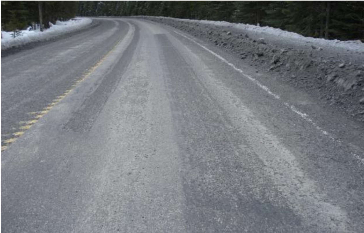
Weather: Rain and cool weather following construction, unacceptable chip loss (CODs)