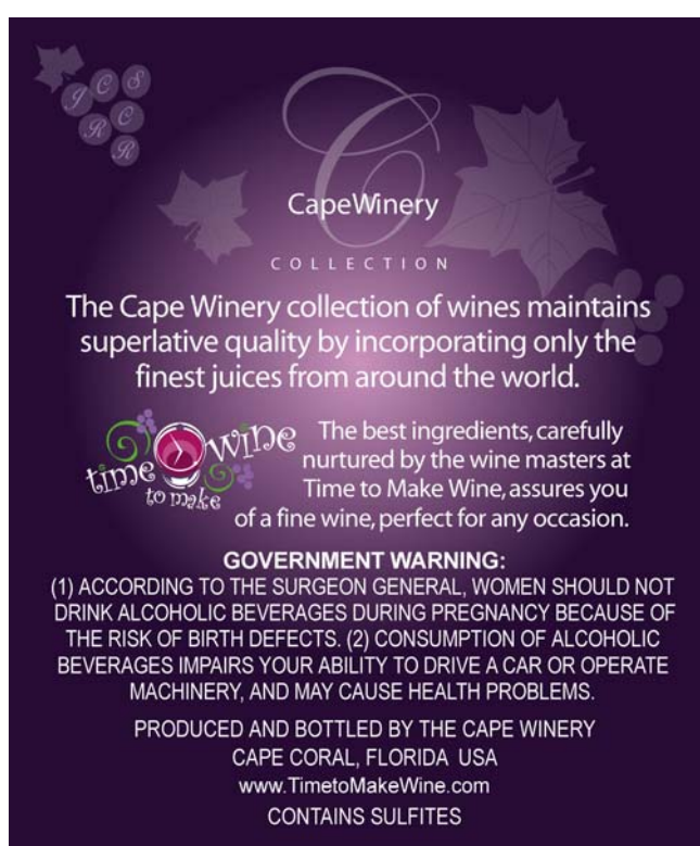
Image Type: Brand (front) Actual Dimensions: 3.33 inches W X 4 inches H

AFFIX COMPLETE SET OF LABELS BELOW Image Type: Back Actual Dimensions: 3.33 inches W X 4 inches H