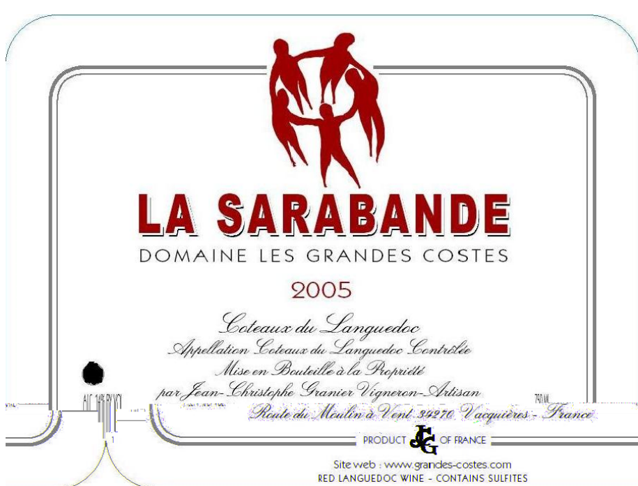
Image Type: Brand (front) Actual Dimensions: 2.28 inches W X 3.11 inches H

AFFIX COMPLETE SET OF LABELS BELOW Image Type: Back Actual Dimensions: 4.72 inches W X 3.54 inches H