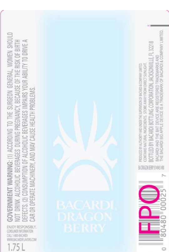
Image Type: Other Actual Dimensions: 0.88 inches W X 0.88 inches H