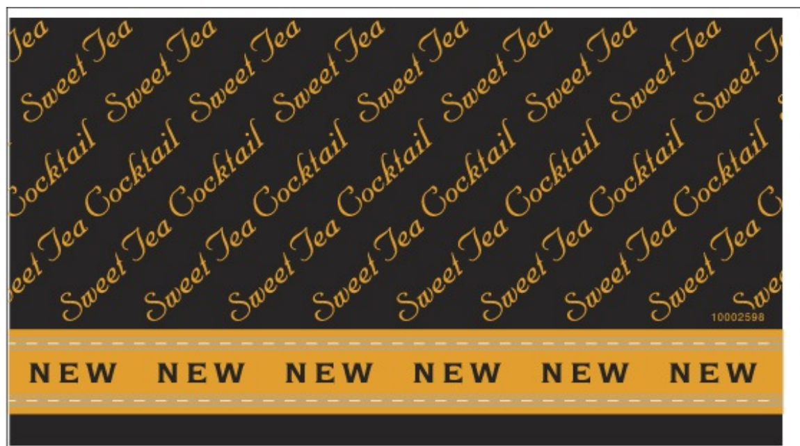
Image Type: Brand (front) Actual Dimensions: 03.94 inches W X 00.80 inches H

Image Type: Other Actual Dimensions: 06.00 inches W X 03.35 inches H