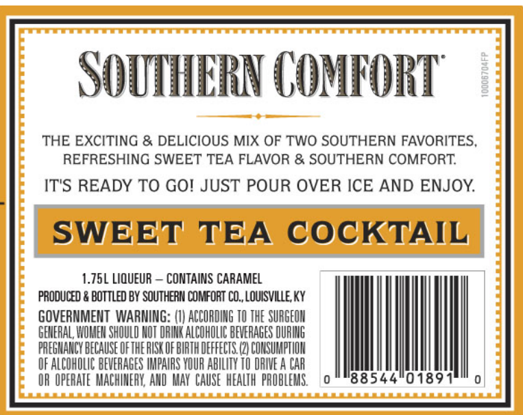
Image Type: Back Actual Dimensions: 04.00 inches W X 03.15 inches H

TTB F 5100.31 (6/2006) PREVIOUS EDITIONS ARE OBSOLETE