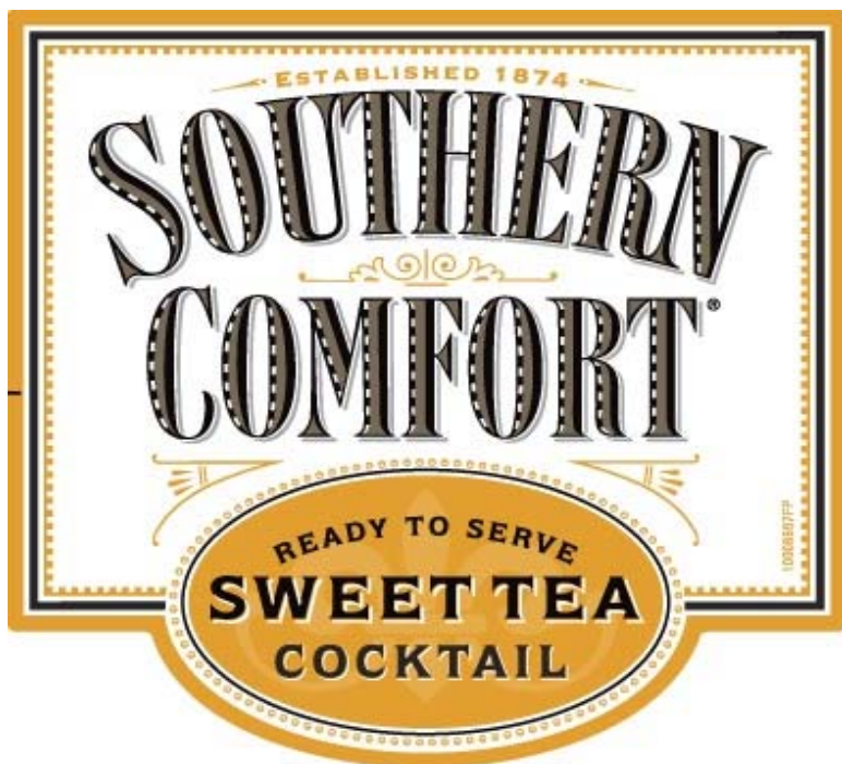
Image Type: Other Actual Dimensions: 06.00 inches W X 03.35 inches H

AFFIX COMPLETE SET OF LABELS BELOW Image Type: Brand (front) Actual Dimensions: 04.00 inches W X 03.60 inches H