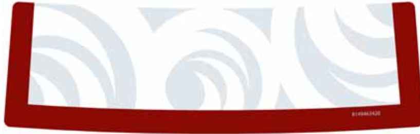
Image Type: Neck

Actual Dimensions: 4.23 inches W X 1.4 inches H