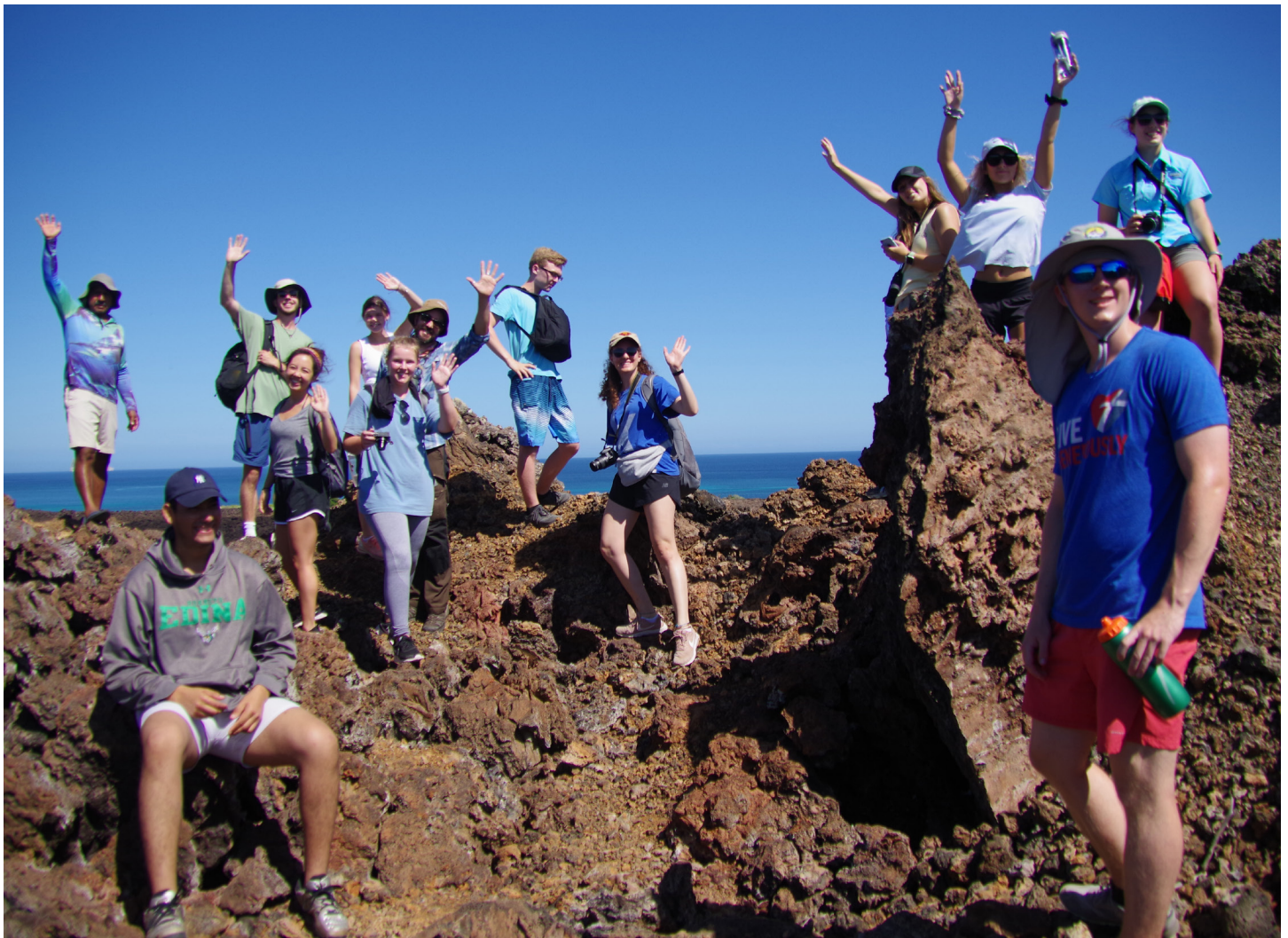
UK Biology students on the Galapagos Island of San Cristóbal investigated the 50,000 year old lava flow at Punta Pucuna during an International Education trip there, May–June 2019.