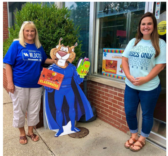
Opening Day of the Story Book Walk

After the program was over, we gave the local daycare the posters and they are going to use them at the center for the kids to read.