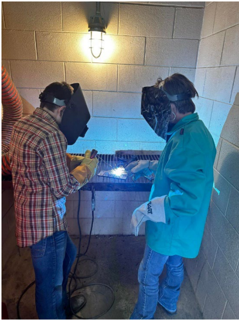
Arcs & Spark Participant with 4-H Agent

According to the Bureau of Labor Statistics, it is estimated that more than 3 million skill trade jobs will remain open by 2028. Skilled trade jobs vary from plumber to electrician to welder. The Arcs & Sparks is a welding program was offered by Bracken County 4-H in hopes to allow students to gain interest in a skilled trade. During the first meeting, youth were introduced to shop safety, proper PPE, and learned how to move their hand to make a weld. This was done by using can squeeze cheese and crackers. The next 4 classes were at the Bracken County High School shop. During these classes participants worked on striking an arc and making a bead with stick welders. The students involved in the program, have already shown interest in further their knowledge of welding.