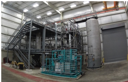
CBTL Pilot Equipment