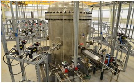
Gasifier and related process components

This facility, nearing completion at the University of Kentucky, is an integrated coal/biomass-to-liquids (CBTL) standalone facility with a capacity of 1 barrel of fuel per day; and can be used as a test-bed for new concepts at an affordable level.