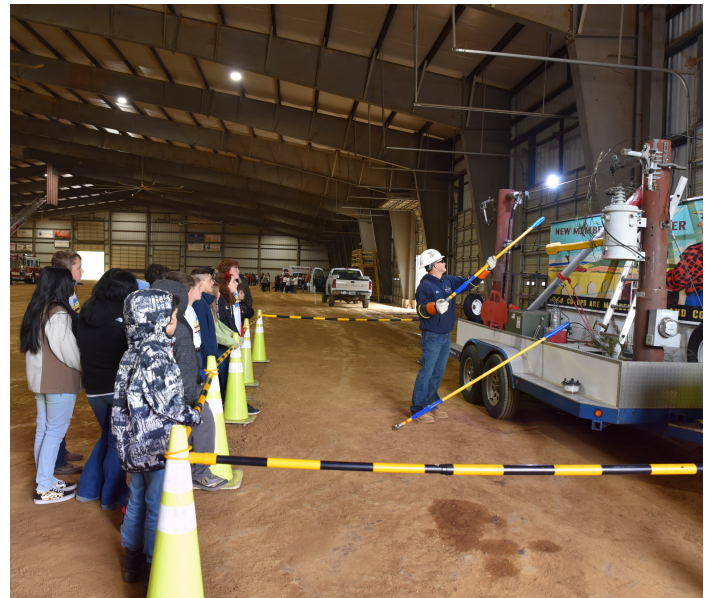
Pictured below: Students watch as a volunteer from Inter-County Energy Cooperative demonstrates electrocution of a hot dog on a power line.