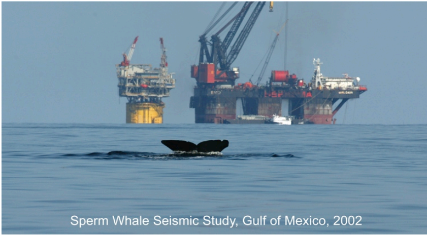
Sperm Whale Seismic Study, Gulf of Mexico, 2002