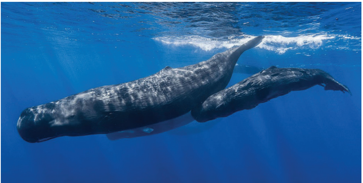
Mother and baby sperm whale

Alaska Longline Fishermen's Association (ALFA) and Southeast Alaska Sperm Whale Avoidance Project (SEASWAP). Created in 2003, SEASWAP is a unique collaboration between commercial fishermen, scientists, and fisheries managers. It is aimed at recommending strategies to reduce economic loss to fishermen from depredation on their commercial fishing gear and entanglement risk to the whales by using biology to understand the complex relationship between sperm whales and fishing—longliners in particular. Acoustic techniques are used to locate the whales. Information on the timing and movement patterns of sperm whales in the Gulf of Alaska using satellite tags can also help fishermen avoid whales by giving them an option to avoid fishing at known whale hot spots.