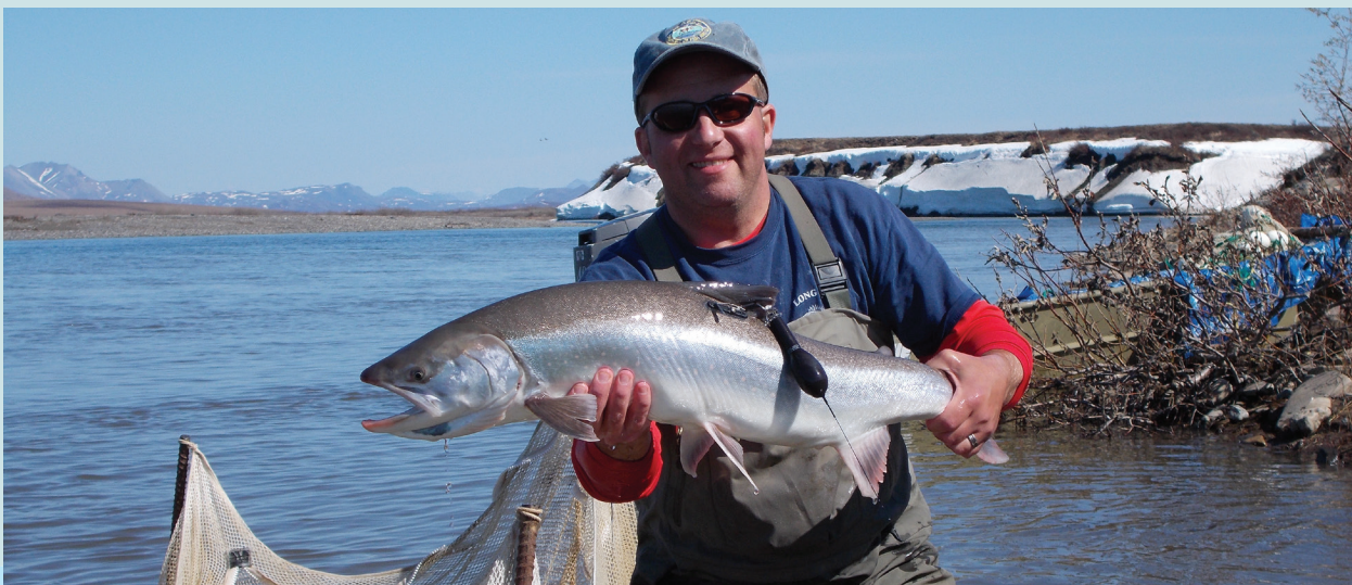
A PSAT-tagged anadromous Dolly Varden from northwest Alaska.