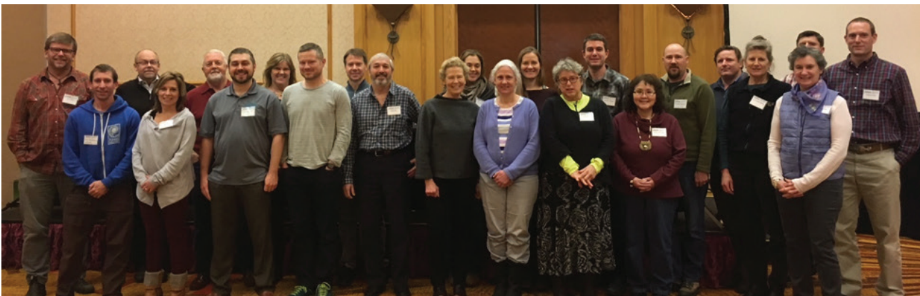
Subset of the Workshop Attendees.

The session provided valuable exchanges among the participants. Nevertheless, it was clear that creating a suitable and useful matrix of regional animal telemetry data needs versus data collection assets is beyond the scope of a workshop breakout session and will depend significantly on the ATN Asset Inventory survey currently underway.