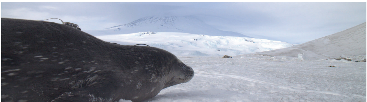
Tagged seal.