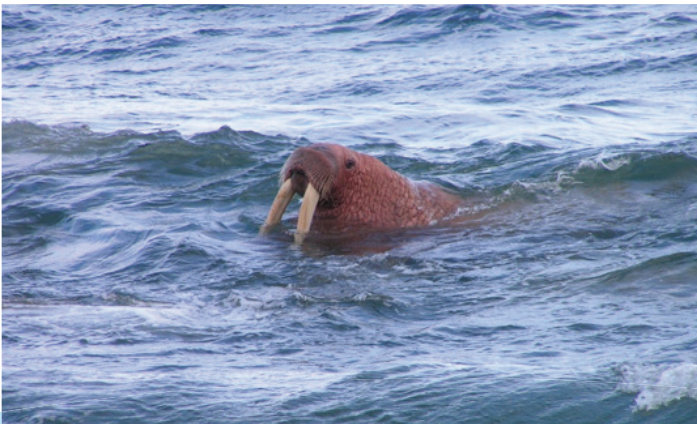
Asveq (Yup'ik Eskimo name for Pacific walrus). – Main Beach - Round Island, Alaska

Alaska Longline Fishermen's Association (ALFA) and SEASWAP cooperative research with fishermen, government, and scientists focus on three key questions: i) How do sperm whales locate the longline deployment? ii) What strategy do sperm whales use to take fish off, or predate the line? iii) How are whales finding particular fish of interest, especially at night?