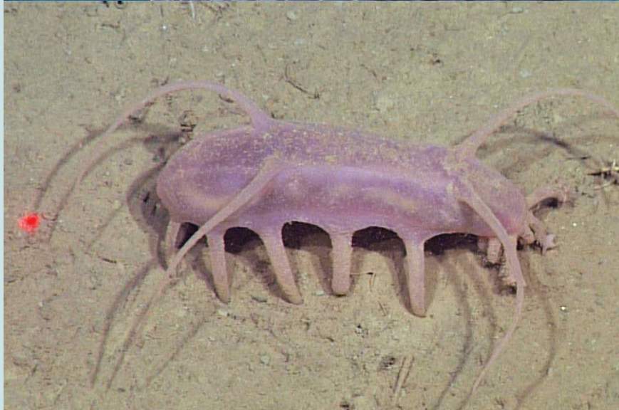
Top: Deep-sea octopuses discovered near Davidson Seamount at 3300 meters. Middle: Tagging and placing tracking device on large billfish. Bottom: Scoloplos globosa sea cucumbers on the seafloor at Station M off the Central California Coast.