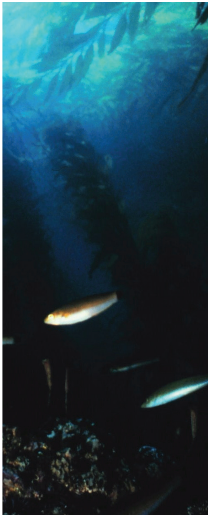
Senorita Fish in a giant kelp forest, Monterey Bay National Marine Sanctuary.