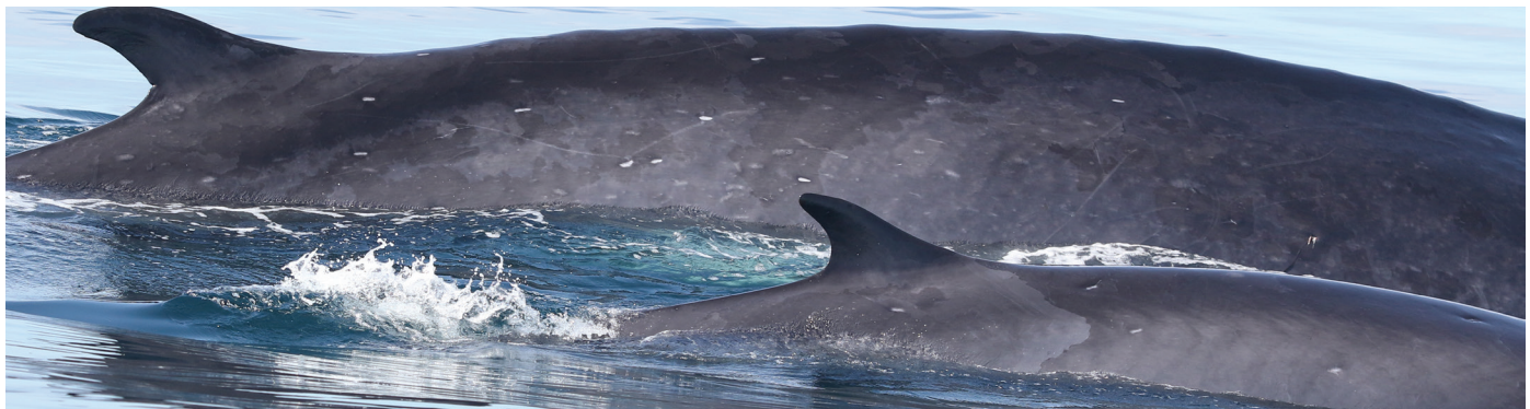
A pair of fin whales off Palos Verdes in Southern California.