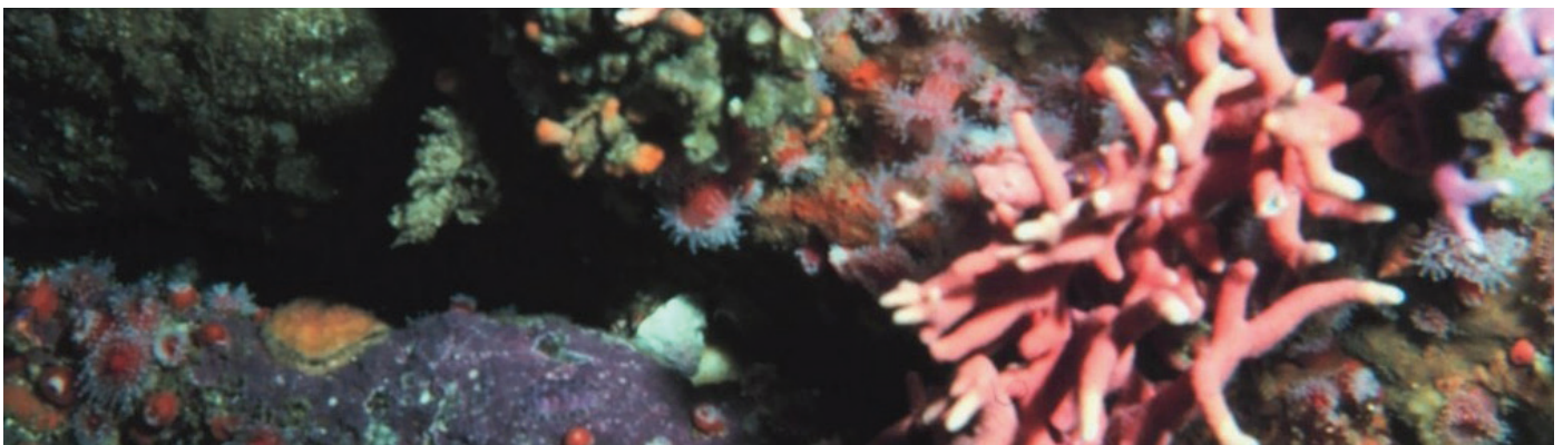
Life on rocky offshore ledges at Monterey Bay National Marine Sanctuary.