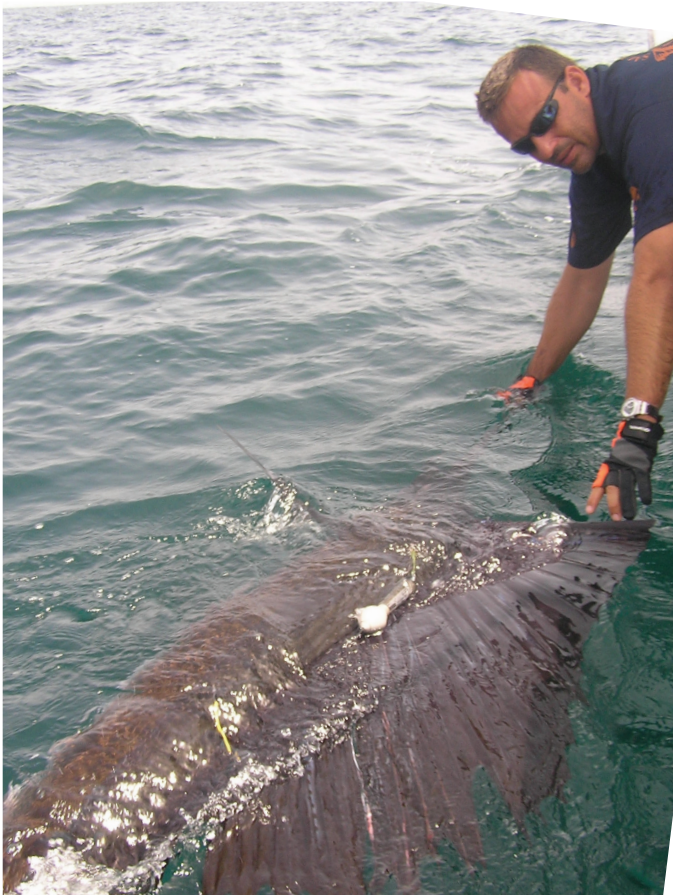
Tagging and placing tracking device on large billfish.

The U.S. IOOS Regional Associations can help close the loop on how the data being collected is making difference institutionally by connecting end-users to researchers to demonstrate how tracking and biologging data are used to make real world policy decisions. U.S. IOOS can convene workshops to integrate acoustics, genomics, and tagging to measure distribution/abundance. High resolution monitoring (including benthic infauna, chemistry, etc. data) along the West Coast enables us to view things at higher resolution by leveraging existing data to better expand information about human impacts.