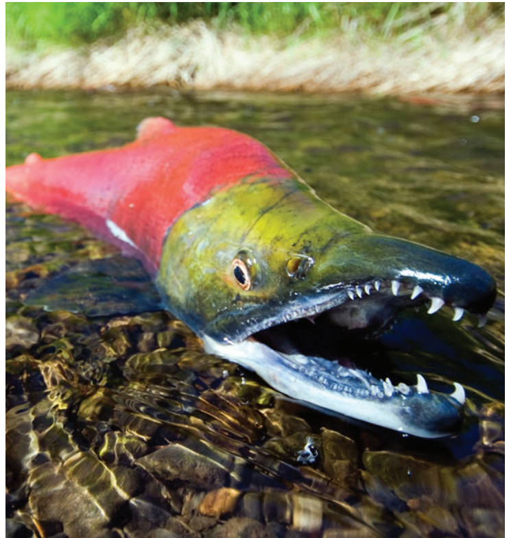
Sockeye salmon.