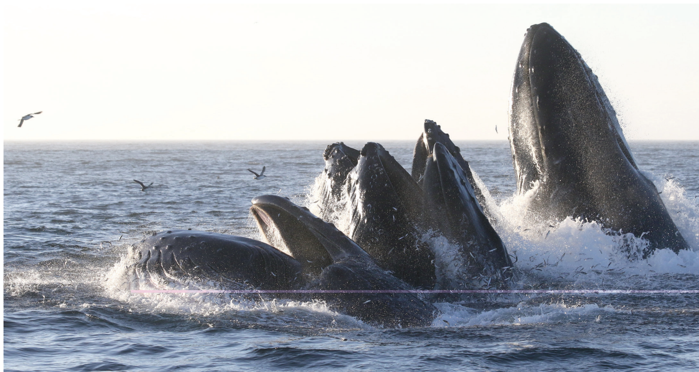
Lunge feeding. Photo Credit: John Calambokidis, Cascadia Research (NMFS Scientific Research Permit #21678)

The focus is to understand the functional and context-dependent responses of marine mammals to change and disturbances, including U.S. Navy sonar and understand the structure and function of marine ecosystems.