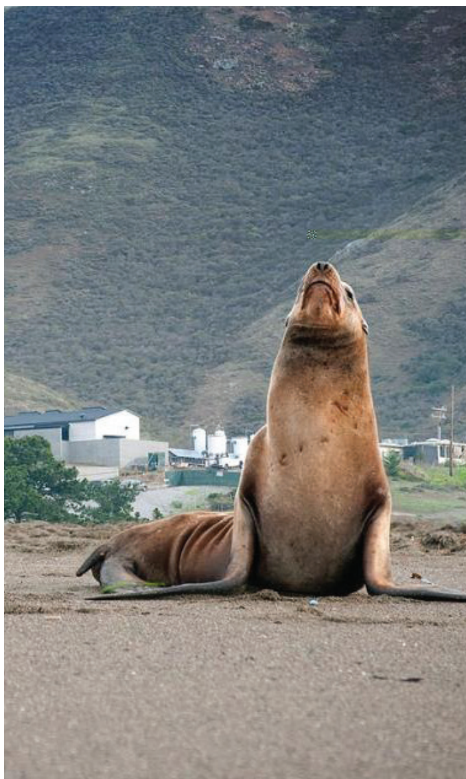
A California sea lion rests on Rodeo Beach in the Marin Headlands with The Marine Mammal Center's hospital visible in the background.

For both the ATN and MBON portals, Axiom utilizes an approach that applies custom services to manage the flow of data throughout the entire data lifecycle—from data creation through to use, reuse, and transformation. Short-term storage and documentation exist for access and sharing by colleagues. Long-term secure archiving exists for preservation and future access and discovery by a larger audience.