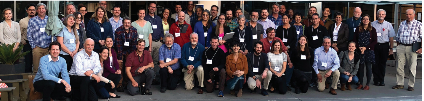
A complete list of workshop participants can be found on pages 49–51.