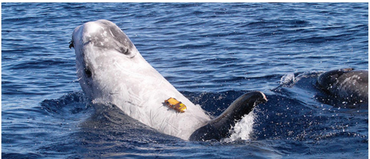
Risso’s dolphins outfitted with tags to track their movement and depth.

The O’Neill Sea Odyssey (OSO) organization educates fourth- through sixth-grade students through hands-on lessons on the relationship between the ocean and the environment. Focusing on underserved schools, OSO covers marine biology, ecology, and navigation. Even though students primarily ask only about marine mammals, OSO would like to use biodiversity and telemetry data to illustrate how food availability and oceanographic conditions are driving what the students are observing from the boat and in the plankton sample. The students collect basic data such as pH, temperature, visibility, depth, and plankton samples from the boat. The OSO would benefit from collaboratively brainstorming with the marine biology community on how to get scientists on board, and how to improve their collection of data and possibly use archival data. Student class size averages per class, totaling 5,276 and more than 100,000 since inception.