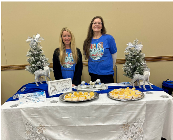
Holiday Cooking School Event