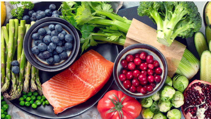
Healthy choices provide many benefits!!