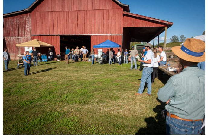
Old Homeplace Farm