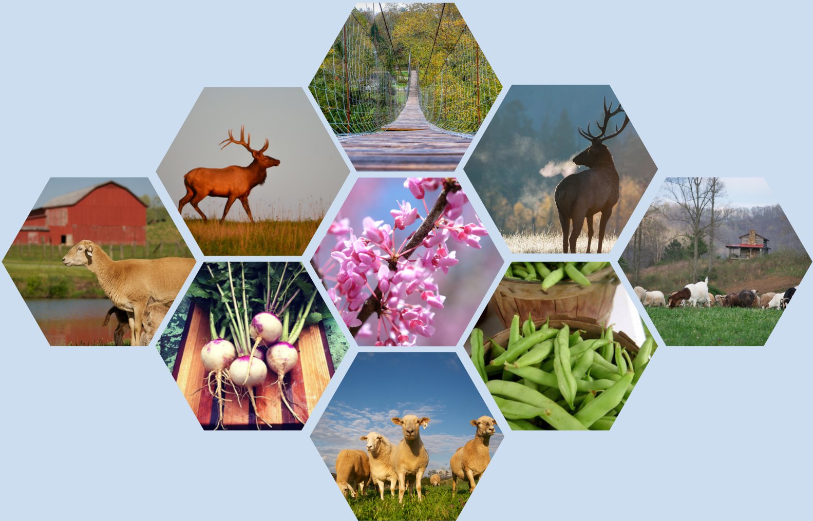
Photo credits: Swinging bridge courtesy of Les Nicholson of Les Nicholson Photography. Elk on the right courtesy of Jilliam Cooper from Getty Images (Canva). Redbud courtesy of Peter Dutton of Getty Images (Canva). All other photos courtesy of Will Bowling.

Interesting Fact: Clay County is the Gateway to the Elk & Redbud Capitals of Kentucky and the Land of Swinging Bridges!