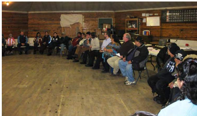
Circle Sentencing, Huslia.

sentencing. A new Child in Need of Aid rule establishes a process by which tribes can register, confirm, and seek enforcement of tribal court orders entered under the federal Indian Child Welfare Act, which gives tribes a strong role in decisions concerning tribal children. Both rules are the product of many years of effort by court staff, volunteer members of the court's advisory rules committees, and tribal representatives. And both represent major steps toward formalizing state-tribal relationships in two areas of law in which both the state and tribes have clear roles to play. I am humbled and grateful to everyone who has given their time and expertise to bring these rules to fruition – for their dedication, their mutual respect, and above all, their patience. It took a long time, but the results will be worth it if we begin to see