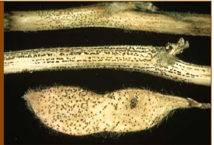
Figure 9. Pod and stem blight infection results in pycnidia, which are different than the microsclerotia charcoal rot produces.

Pycnidia are generally larger than microsclerotia and are present in linear rows on the outside of stems, whereas charcoal rot microsclerotia form throughout (inside) the taproot and lower stem; leaves do not remain attached as they do when charcoal rot affects soybeans.