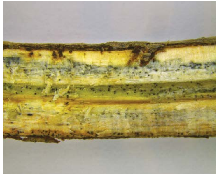
Figure 2. Macrophomina phaseolina colonizing a soybean stem.