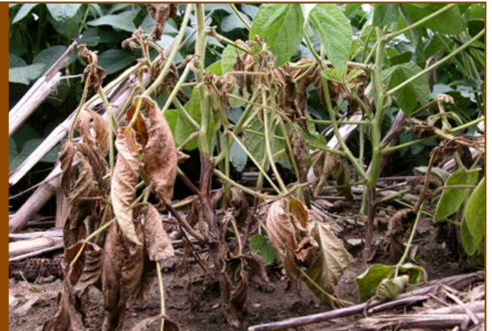
Figure 10. Phytophthora-infected plants have dark brown lesions on the outer stem tissue that are continuous from the roots and up the lower stem.

Stems of Phytophthora-infected plants have characteristic dark brown lesions visible on the outer stem tissue that are continuous from the roots and up the lower stem.