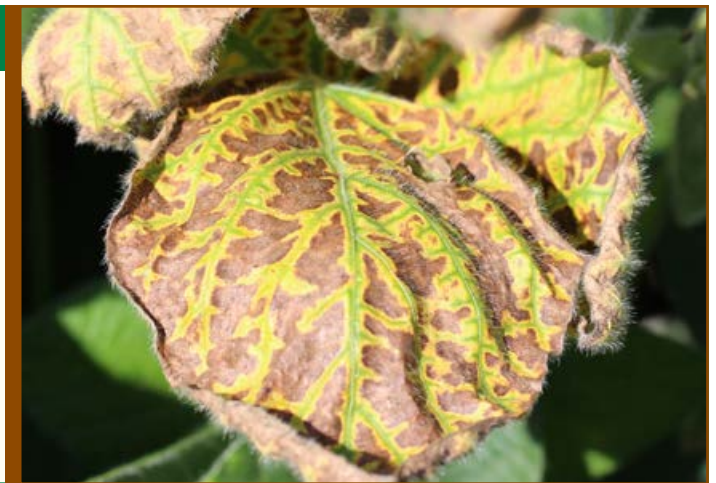
Figure 14. Sudden death syndrome symptoms occur between the veins.

Symptoms of SDS occur between the veins rather than causing generally brown, crinkled leaves.