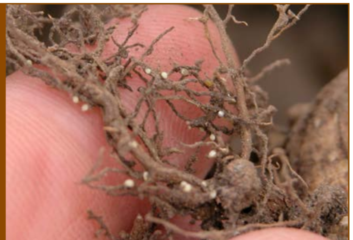
Figure 13. Plants infected with soybean cyst nematode can be distinguished by white cysts on the roots.

White SCN females are most readily observed on soybean roots starting about six weeks after crop emergence.