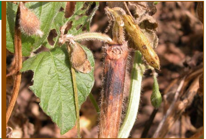
Figure 14. Stem canker produces brown to black, slightly sunken lesions.

Stem canker is distinguished by the production of brown to black, slightly sunken lesions or “cankers” that start at the nodes and grow completely around the stem. These will typically not be at the soil line extending upward like Phytophthora root and stem rot.