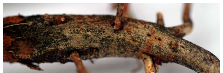
Figure 7. Microsclerotia of the charcoal rot fungus on the lower portion of a soybean stem.