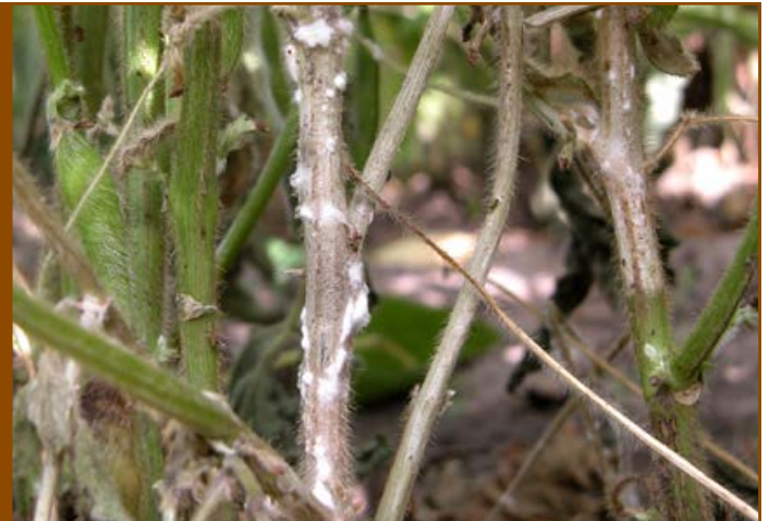
Figure 12. Plants with white mold have fluffy white growth on the outside of stems.

Sclerotinia-infected plants can be identified by the presence of a fluffy white growth on the outside of stems. In addition, the sclerotia produced by the sclerotinia stem rot fungus, which are also hard and black, are much larger than charcoal rot microsclerotia.