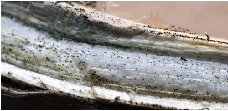
Figure 5. Charcoal rot fungus microsclerotia embedded in a soybean taproot (top) and caked on the surface of a soybean root (bottom).