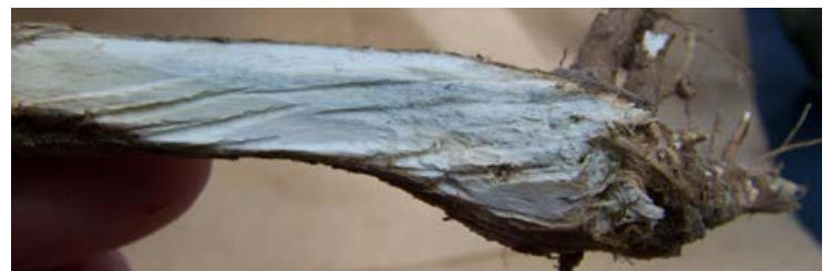
Figure 6. Gray discoloration of the lower portion of a soybean stem caused by charcoal rot.

Plants affected by charcoal rot may initially have a gray discoloration on the lower woody portion of the stem (Figure 6). Microsclerotia also will be visible on the lower portion of the plant, often just under the outermost layer of stem tissue (Figure 7). Microsclerotia are less than 1/25 of an inch (1 mm) in size. To the naked eye, it will look as if the root or stem has been “peppered” with black spots. Upon closer inspection with a hand lens, individual microsclerotia can be seen within the plant tissue. In some instances, a fine line of stem decay and discoloration can be observed in root cross-sections of soybean plants (Figure 8).