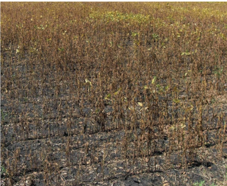
Figure 1. Severe charcoal rot in a soybean field.

favorable for disease development — such as warmer summer and winter temperatures and reduced rainfall — have likely contributed to its presence. Yield loss from charcoal rot is highly variable, but farmers can reduce crop injury by implementing best management practices based on a better understanding of this disease.