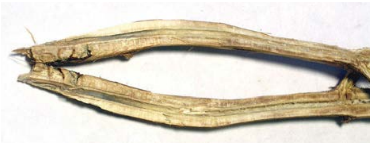
Figure 8. Internal soybean stem discoloration due to charcoal rot.

Charcoal rot is hard to diagnose in dry years, since it is difficult to distinguish between the symptoms of the disease and those of general drought stress. However, plants with charcoal rot die more quickly during periods of drought stress than those without the disease. To accurately identify charcoal rot, pull symptomatic plants and split the lower stems and taproot to confirm discoloration as light gray or silver (Figure 6) and the presence of black streaks (Figure 8) and microsclerotia (Figure 7).