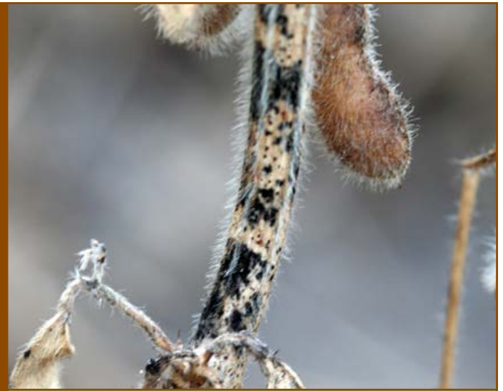
Figure 11. Plants infected with saprophytic fungi do not have microsclerotia in the inner stem and root tissue like plants infected with charcoal rot do.

Soybeans that senesce early will be more heavily colonized by saprophytic fungi, giving stems a dark appearance. In these situations, be sure to examine the inner plant tissue of the stem and root to determine if microsclerotia are present.