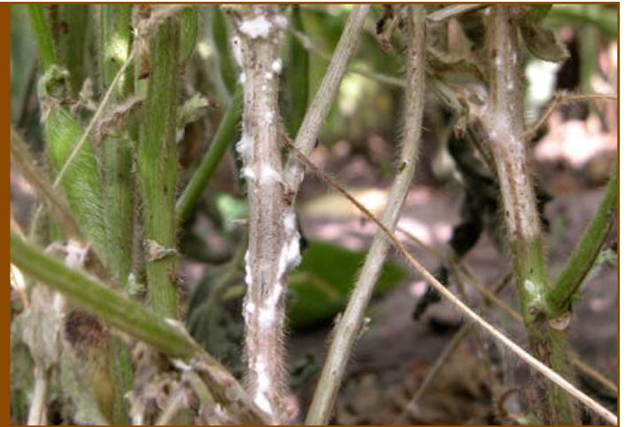
Figure 12. Plants with white mold have fluffy white growth on the outside of stems.

Sclerotinia-infected plants can be identified by the presence of a fluffy white growth on the outside of stems. In addition, the sclerotia produced by the sclerotinia stem rot fungus, which are also hard and black, are much larger than charcoal rot microsclerotia.