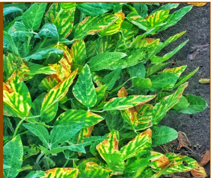
Figure 19. Triazole fungicide injury can resemble SDS foliar symptoms.

Check the pattern of symptom development and field activity prior to symptom development. Symptoms will only appear on leaves.