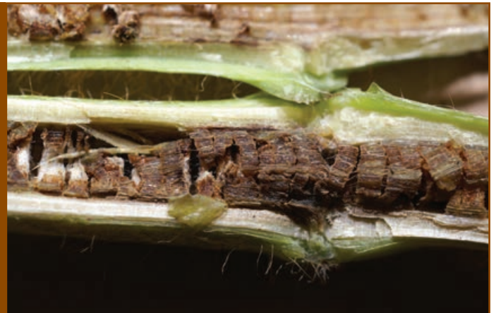
Figure 13. Stems infected with brown stem rot have brown discoloration and disking in the pith.

BSR-infected plants will have discoloration in the pith of the stem. BSR does not cause rotted roots.