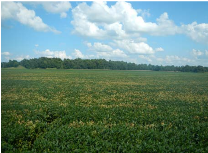
Figure 10. Most often, SDS symptoms are patchy in a field.