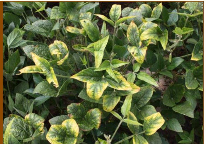
Figure 18. Potassium deficiency results in yellowing of upper soybean leaves.

The foliar symptoms of potassium deficiency are different from SDS symptoms. Stems and roots with potassium deficiency will not have symptoms.