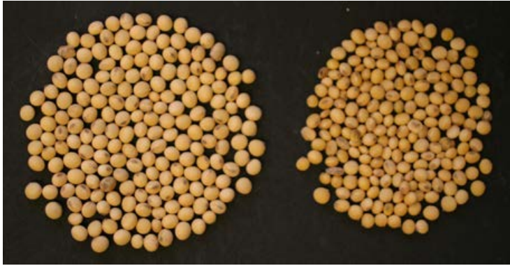
Figure 9. Seeds from a healthy soybean plant (left) compared to seed from a soybean plant affected with SDS.

development, yield losses can be minimal. Losses are rarely fieldwide since the disease often occurs in patches (Figure 10). If foliar symptoms appear at or after growth stage R6, yield loss may be minimal.