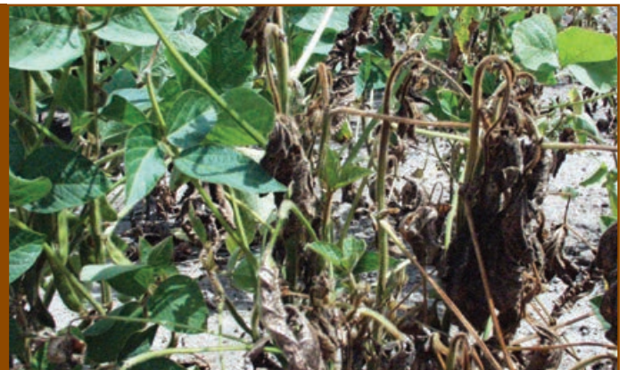
Figure 15. Brown discoloration in the lower stem is indicative of Fusarium wilt.

Figure 14. (Top) Plants with Fusarium wilt will die prematurely and retain leaves, similar to stem canker.