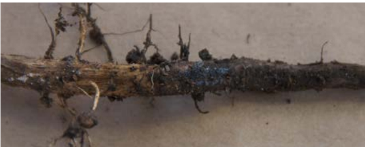
Figure 5. Blue spore masses can sometimes develop on roots infected with Fusarium virguliforme , the fungus that causes SDS.