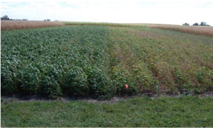
Figure 12. Crop rotations that do not include corn can help reduce SDS. The soybeans pictured on the left are part of a three-year rotation with oats and red clover. The soybeans on the right are part of a two-year rotation (corn-soybean) and have substantially higher levels of SDS.

One study in Iowa suggested that a more diverse rotation can reduce SDS. In this study, adding a third year into the corn-soybean rotation (where either alfalfa or an alfalfa/red clover mixture were planted) reduced the amount of SDS that developed in the subsequent soybean crop (Figure 12). Incorporating small grain crops into the rotation can also reduce disease. More research is needed to understand the effect of crop rotation and cover crops on SDS.