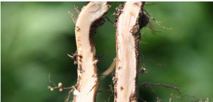
Figure 4. Plants affected by SDS may show brown discoloration in the taproot.