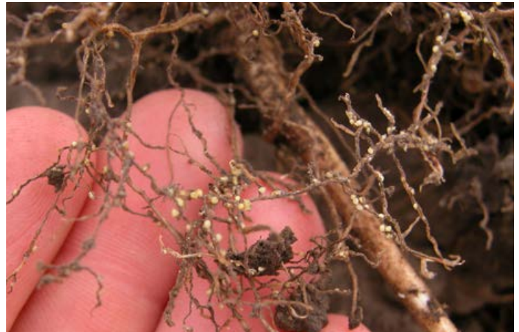
Figure 8. Soybean cyst nematode cysts on roots.

Some crop production practices may also increase the risk of disease development. Fields with poor soil nutrients, low pH, poor drainage, or moderate to severe soil compaction are at higher risk of SDS.