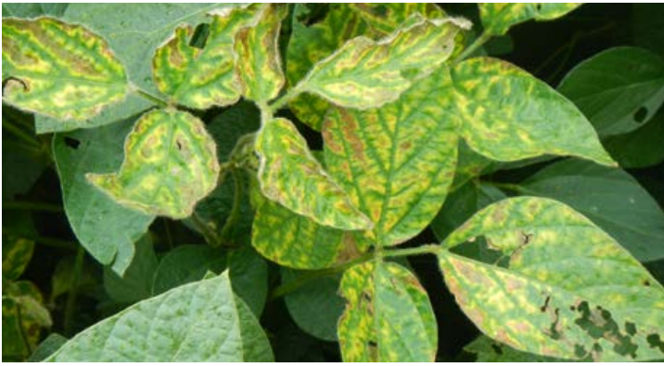
Figure 2. Interveinal chlorosis and necrosis on leaves with SDS.