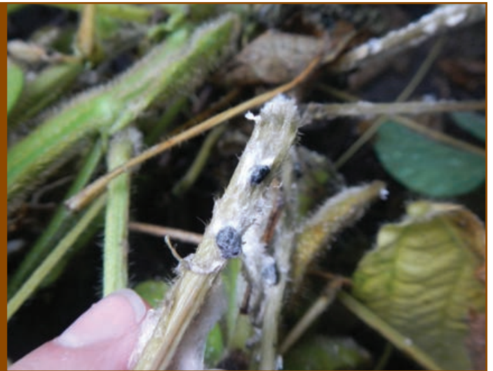
Figure 17. White fungal growth and black fungal sclerotia are present on plants affected by white mold.

Plants infected with white mold have white fungal growth on the outside of stems. In addition, the white mold fungus produces sclerotia that are hard and black.