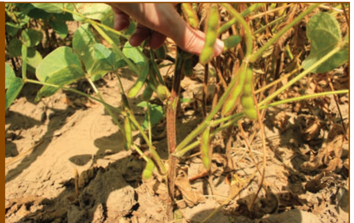
Figure 16. Stem canker lesions often extend below the soil line.

A plant infected with stem canker often has a characteristic red lesion on the outside of the stem. The lesion will typically start at a node above the soil line and extend upward.