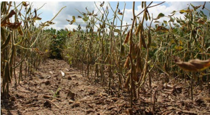
Figure 3. Soybean plants prematurely defoliate with severe SDS.