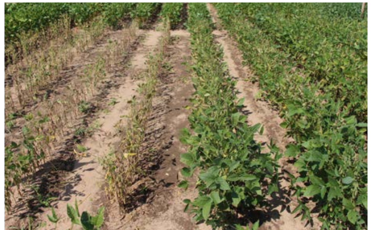
Figure 11. SDS symptoms in a resistant variety (right and behind) and a susceptible variety (left).

Weather and field conditions influence disease severity, even on partially resistant varieties. Most soybean breeding programs have concentrated on evaluating resistance based on foliar symptoms. Less is known about resistance to root rot, and the correlation between root rot and foliar symptoms is not well understood.