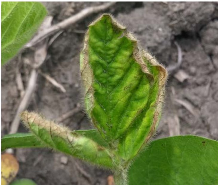
Figure 7. Early-season SDS symptoms.