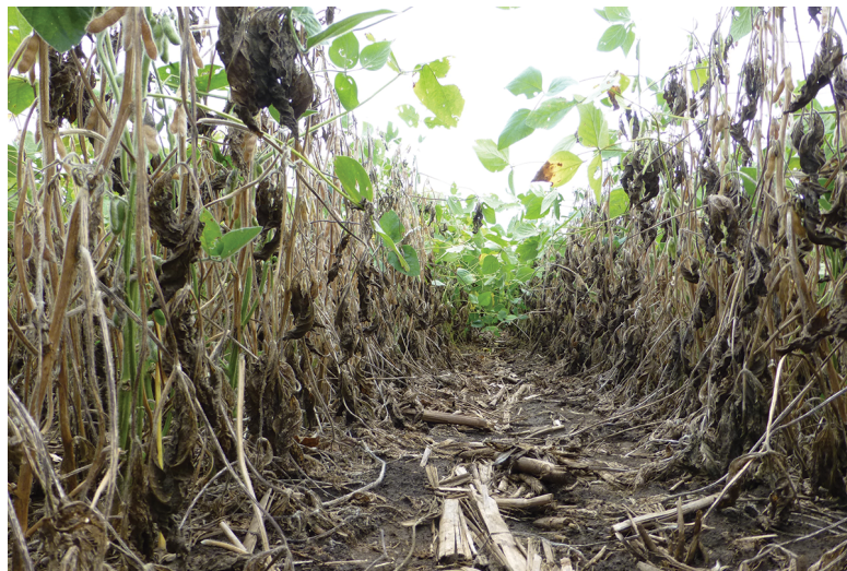
Leaves of plants with stem canker remain attached after wilting, unlike symptoms of SDS.