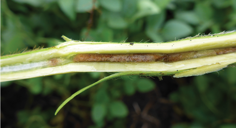
Pith discoloration in the stem distinguishes brown stem rot from SDS.