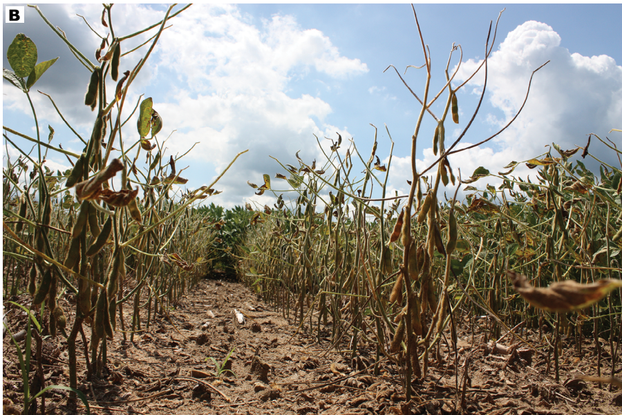
(A) Interveinal chlorosis and necrosis from SDS and (B) Defoliated plants from SDS with petioles still attached.