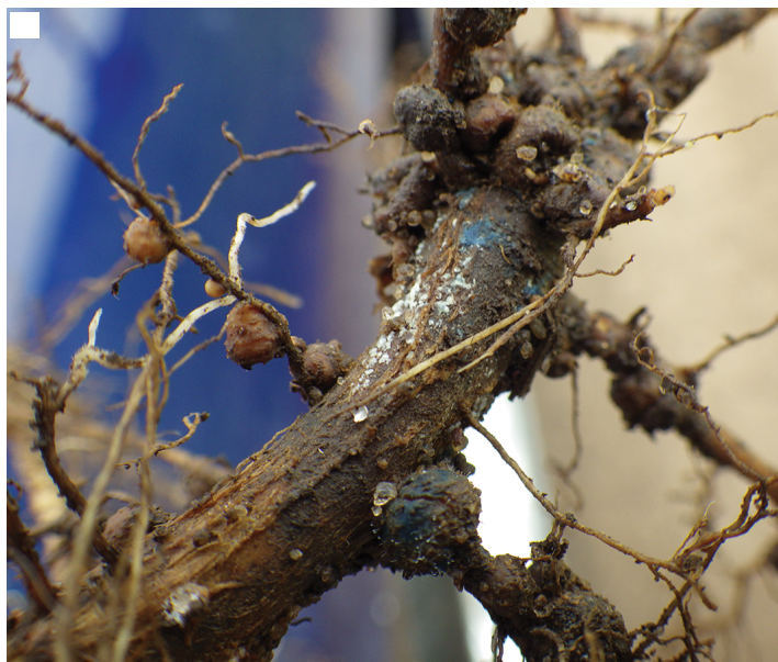
(C) Taproot discoloration symptoms of SDS and (D) Blue fungal growth on roots.