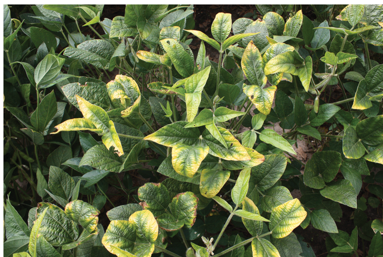
Potassium deficiency symptoms.