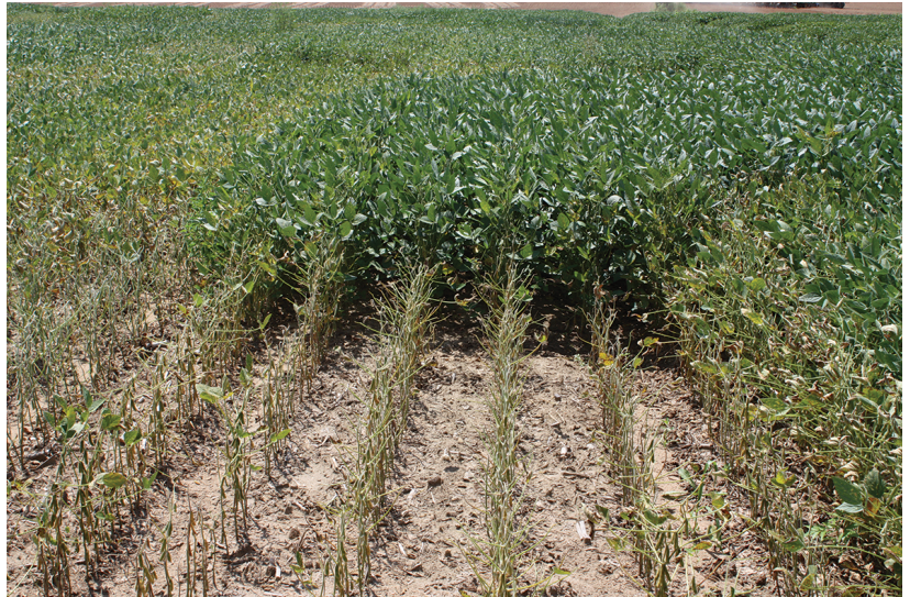
Planting soybean varieties with resistance to SDS can help manage the disease. This shows the differing varietal responses of more resistant plants (back) compared to those that are more susceptible (front).

An integrated SDS management strategy is necessary since a single management tactic alone is not likely to provide adequate results. Management strategies include planting soybean varieties with resistance to SDS, using effective fungicide seed treatments, avoiding or reducing soil compaction, improving soil drainage in fields with recurring SDS, and maintaining proper pH and fertility levels.