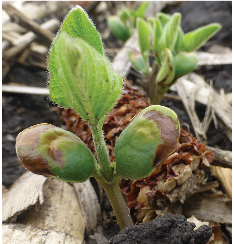
Figure 1. ILeVO® injury (halo effect) on soybean cotyledons

Cool, wet conditions make phytotoxicity worse for both ILeVO® and preemergence herbicides. These conditions also favor infection by the fungus that causes SDS. Research conducted by several Land Grant Universities and Ontario Ministry of Agriculture, Food and Rural Affairs (OMAFRA) indicates that ILeVO® may be a useful SDS-management strategy in fields with a history of SDS that will be planted in less than ideal conditions.