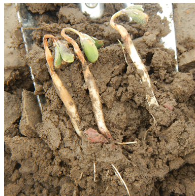
Figure 2. Herbicide injury to soybean seedlings