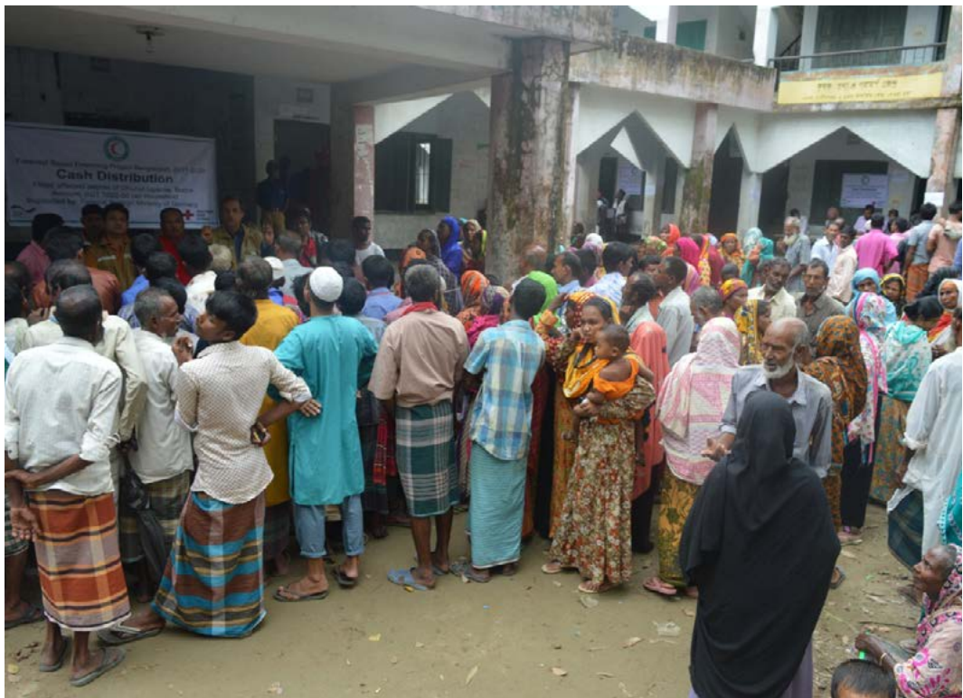
FbF cash distributions, Bogra district, Bangladesh, July 2017 monsoon

Warnings are available, but are they usable in the humanitarian sector? A warning which is accessible and perhaps useful for some users may not be actionable for disaster managers. For example, a tornado warning issued at 3 hours lead time (length of time between a forecast issuance and the timing of potential impact) may be very useful for the aviation industry to make decisions on whether airport operations should cease. However, it may be too short notice for the humanitarian sector to take appropriate early action, although the potentially affected communities could still take precautionary actions – if warnings reach them and they are prepared on how to react.