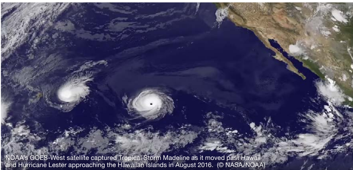
NOAA's GOES-West satellite captured Tropical Storm Madeline as it moved past Hawaii and Hurricane Lester approaching the Hawaiian Islands in August 2016.

Red Cross and Red Crescent National Societies can benefit from establishing direct collaboration with the national agencies responsible for providing meteorological and hydrological services – here is a description of how to proceed, and some do's and don'ts.