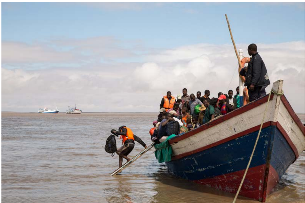
Cyclone Idai, Mozambique, Red Cross preparedness, 14 March 2019

The World Meteorological Organisation (WMO) is urging NMHS to focus more on developing impact-based forecasts (IBF), 3 and recognises that NMHS cannot develop these kinds of forecasts by themselves. Thus, an opportunity for National Societies to potentially help NMHS develop impact-based forecast messages. Instead of providing information on what the natural hazard (such as heavy rainfall) may be, information on the likely effects of the heavy rainfall (e.g. flash floods) enables us to plan for appropriate early actions. In order to define areas and populations that would be most impacted by forecasted climate hazards, NHMS partnerships are required with disaster managers – including National Societies – to bring in information on vulnerability, exposure and capacity. Understanding the places where impact may occur, and at what magnitude, enables a National Society to inform risk reduction measures, preparedness and response action planning. The fact that a National Society works closely with local authorities means that local government departments can be mobilised to incorporate impact-based forecast messages in their information dissemination mechanisms.