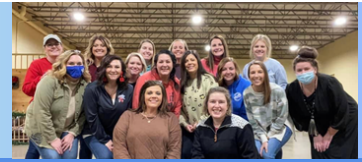
Picture Above is of the Modern Homesteading Homemakers Club

According to its website, the Kentucky Extension Homemakers Association (KEHA) is a volunteer organization that works to improve the quality of life for families and communities through leadership development, volunteer service, and education. County homemaker organizations provide leadership opportunities to its members through filling an office, teaching a lesson, chairing an activity, and being a part of many local associations. Most importantly, it provides companionship and lifelong friendships for most of its members.